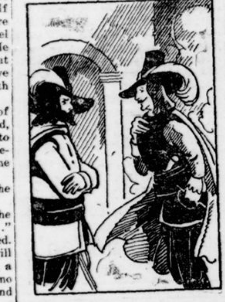
"We meet again at last," he said. "I hope you are satisfied."

CHAPTER XIX. THE MEETING. The Milagroza, with her consort, the Hidalgo sailing after her, ran straight into the arms of Captain Blood.