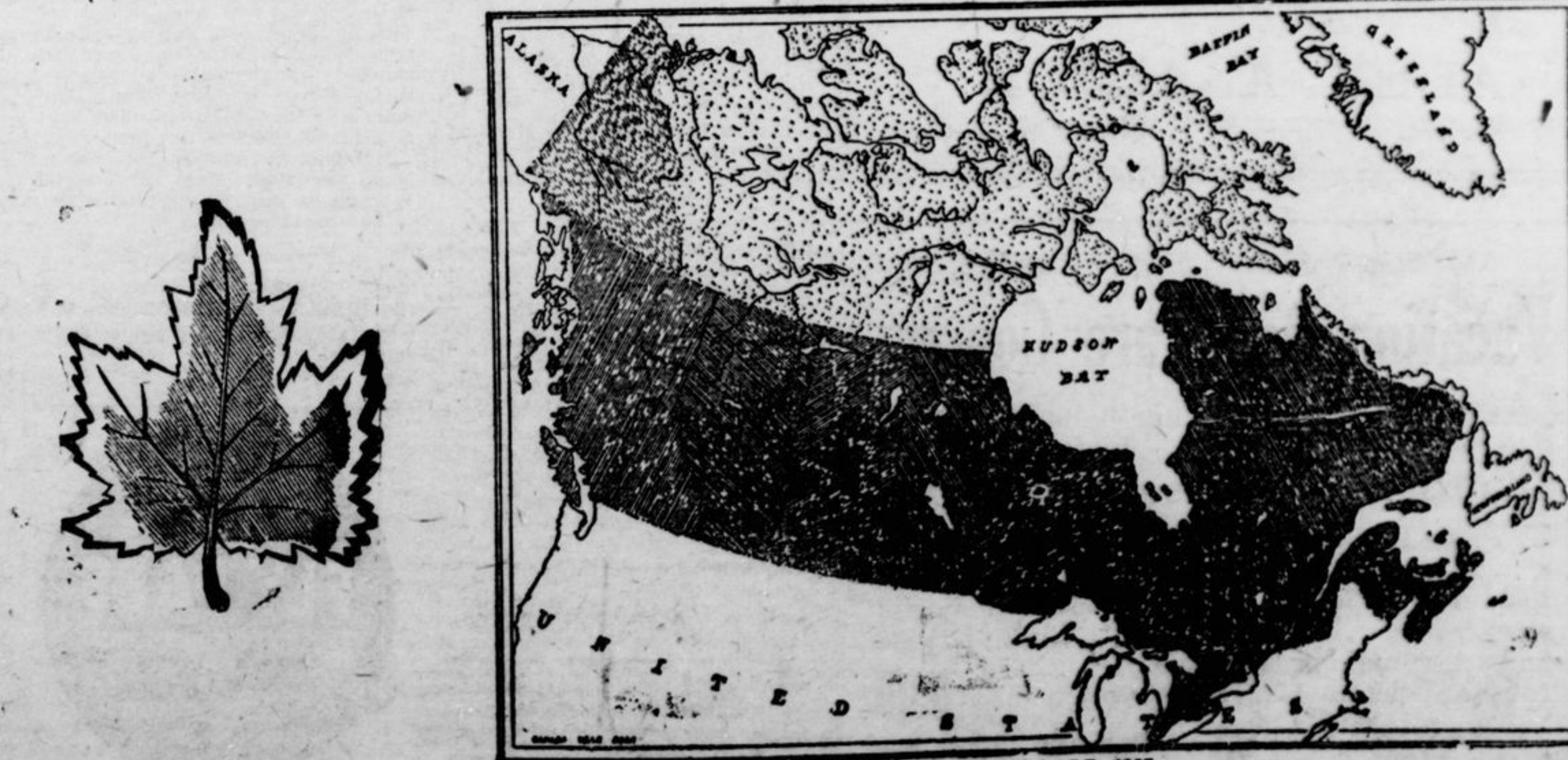
THE CANADA OF 1867 Compare the Canada at Confederation with the Canada of today.