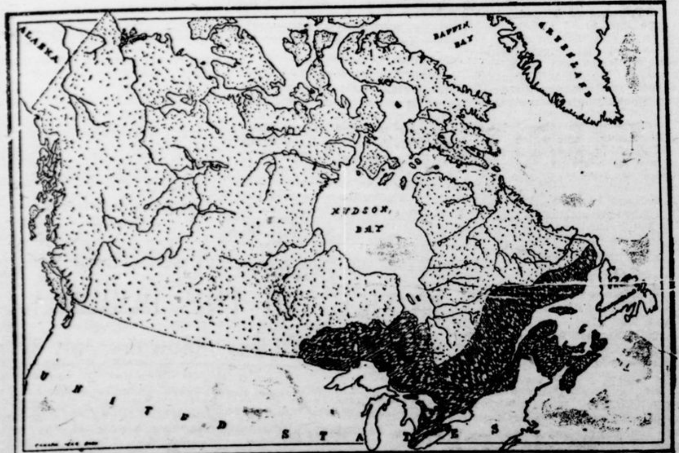
Little the "Fathers of Confederation" dream of this mighty Country. Compare this with the maps showing Canada in 1763 and 1867.

race, the Irish race, the Scottish, or any other race. They are a new people, of mixed origin, born in a new land. Many of them are the sons and daughters of stock that has been on this continent for 200 years. These people belong to the Canadian race and no other, and the census officials should know it.