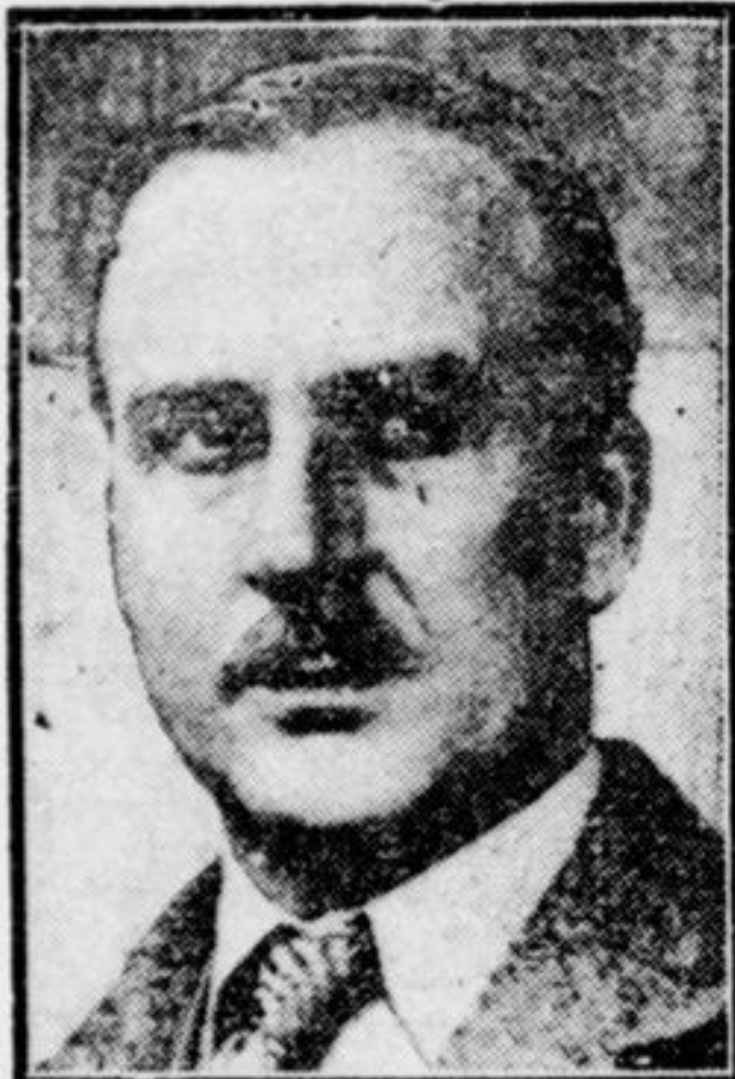
Sir Alan Cobham Famous British aviator, who, with Chamberlin, may take the Columbia on a new flight, details of which are still a secret.

Few people realize what an almost perfect condition prevails along a large part of the great wall of China. The bricks of the parapet are as firm as ever, and their edges have stood the severe climate of North China with scarcely a break. The paving along the top of the wall is so smooth that one may ride over it with a bicycle, and the great granite blocks with which it is faced as smooth and as closely fitted as when put in place over 2,000 years ago. The entire length of this wall is 1,400 miles; it is twenty-two feet high, and twenty feet in thickness. At intervals of one hundred yards or so there are towers some forty feet in height.