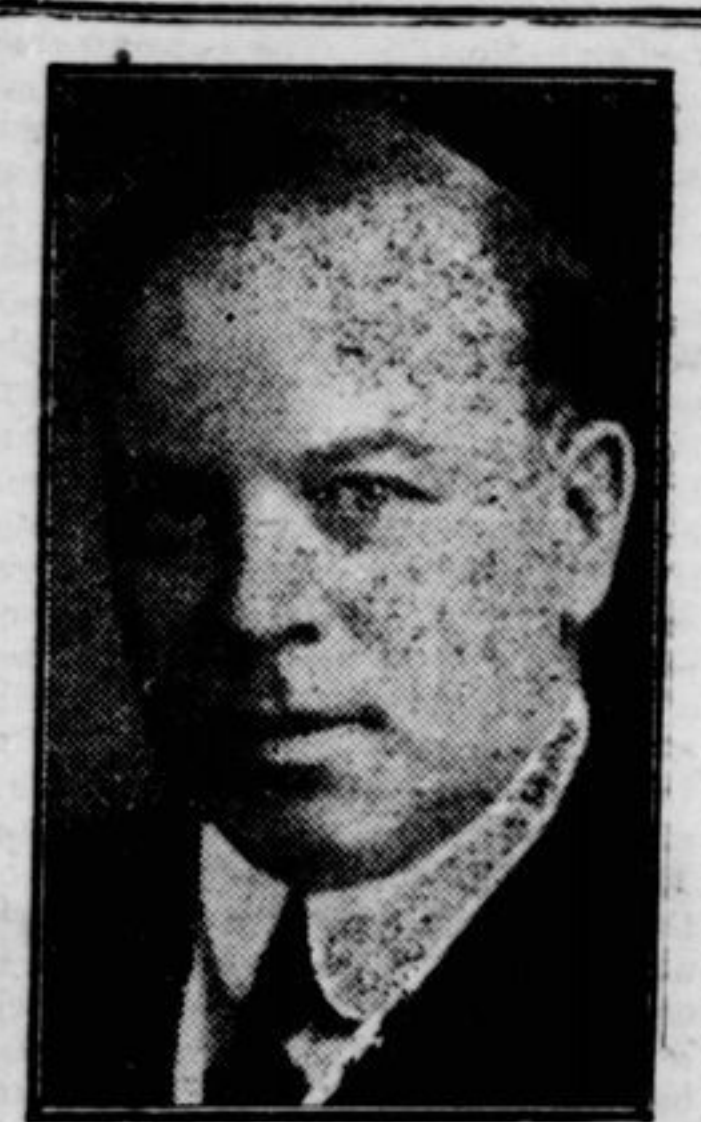
HON. W. L. MacKENZIE KING Who has been returned to power with an increased majority