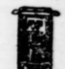
Happy Thought Gas Range is beautiful, economical, efficient.