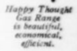
Happy Thought Gas Range is beautiful, economical, efficient.

Happy Thought Pipe, Pipeless and Combination Warm Air and Hot Water Furnaces serve every type of home.