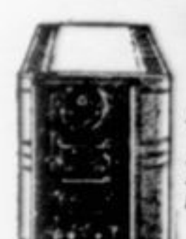
Happy Thought Furnace saves labor and fuel.