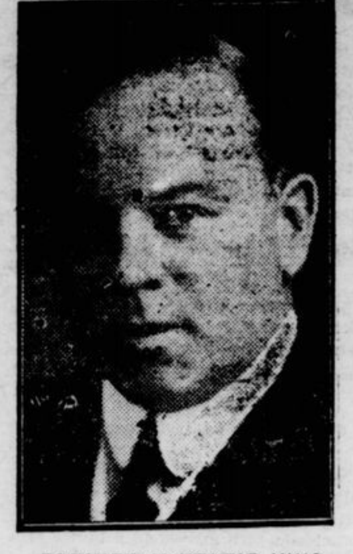
PREMIER MCKENZIE KING Liberal Leader, who is appealing to the people on Oct. 29th.