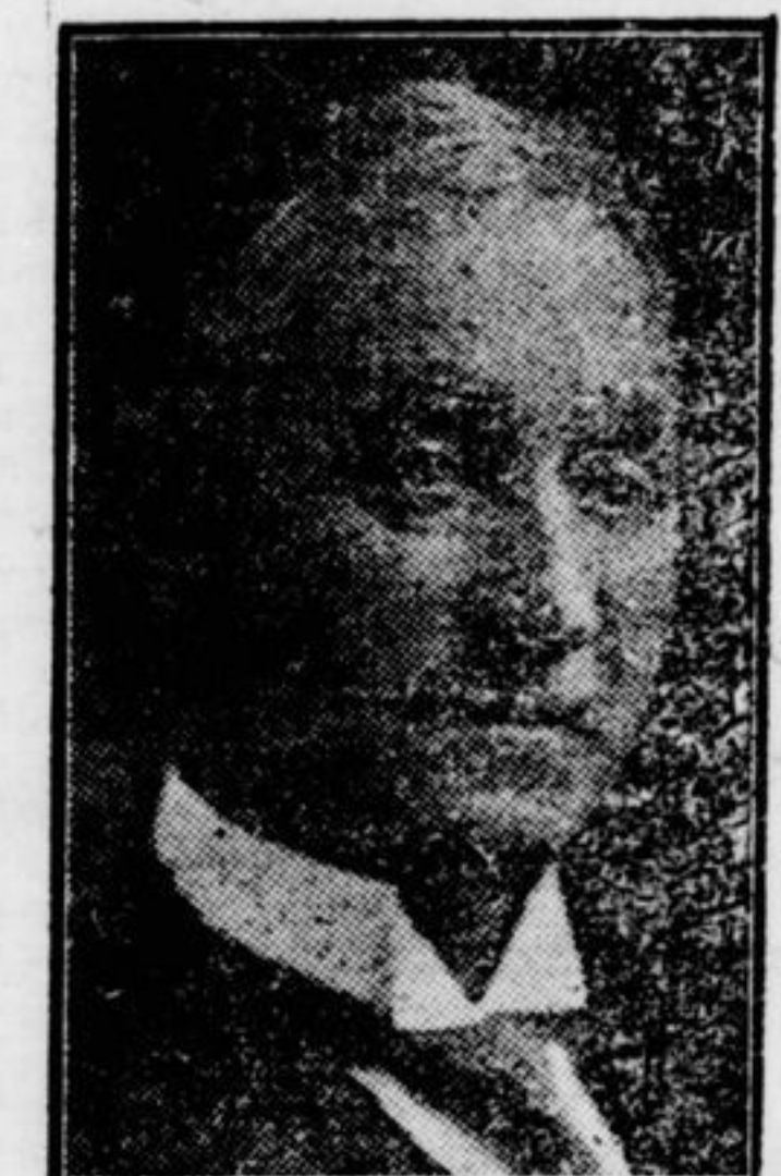
HON. J. A. ROBB Minister of Finance