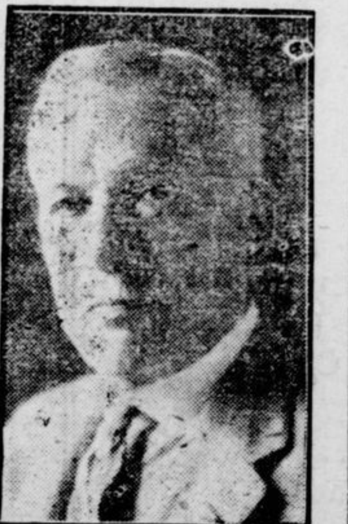
HON. GEO. P. GRAHAM Minister of Railways