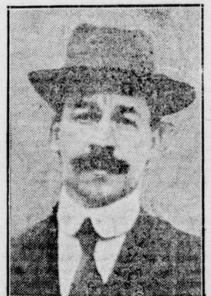
Sir Herbert Samuel High Commissioner of Palestine

It was Sir Herbert Samuel's office to institute a government for Palestine when he assumed the office of High Commissioner on July 1, 1921, upon the ending of the military administration. What kind of government was it to be? In a measure the nature of the government had been fixed by the mandate, which neither Great Britain nor the High Commissioner had the power to amend. The duty of the mandatory power is to execute the will of the League of Nations. Article II. of