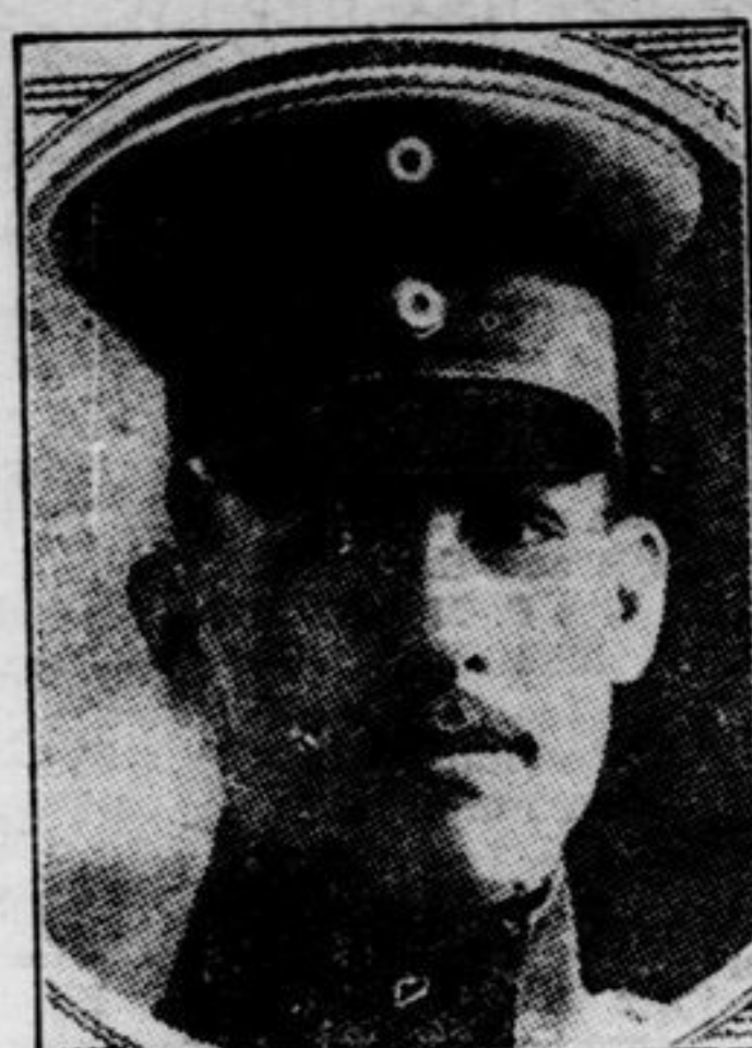
KING GEORGE OF GREECE

The Jordan is the world's most crooked river, wandering 213 miles to cover sixty.