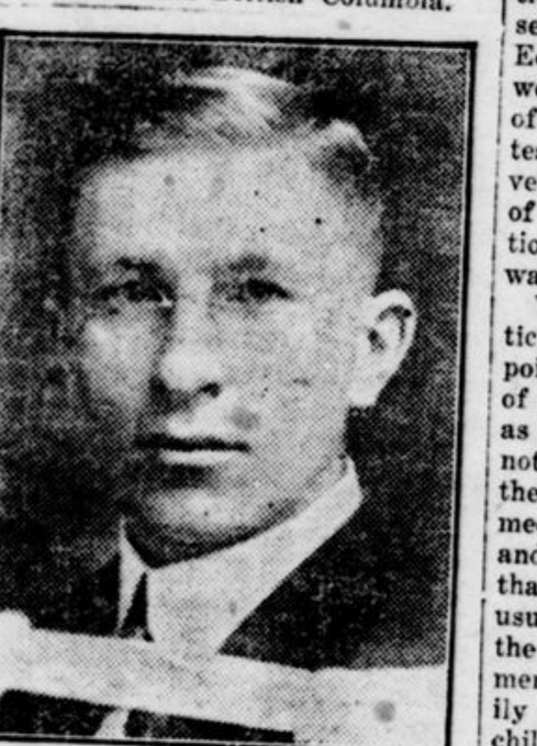
Dr. F. C. Bunting, whose discovery of insulin, a serum for the cure of diabetes, has brought unqualified approval and praise from medical men on both sides of the Atlantic.

Breslau, in Silesia, possesses a chimney 50 feet high made entirely of compressed paper. It is stated to be fireproof.