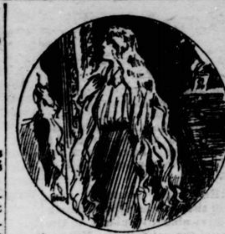
Della looked long and anxiously in the mirror.

Seven dollars a week or a million a year--what is the difference? A mathematician or a wit would give you the wrong answer. The Magi brought wonderful gifts, but that was not among them. This dark assertion will be illuminated later on.