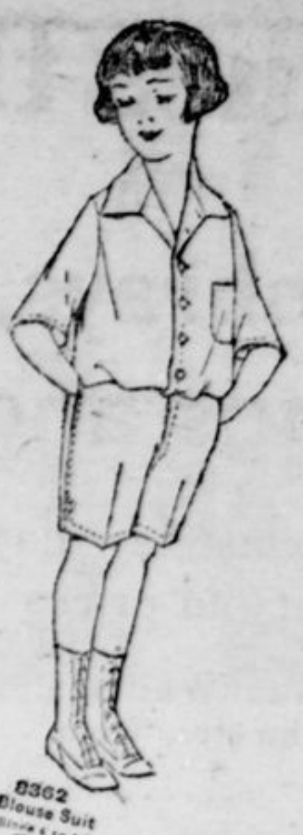
This boy's blouse suit may be made with or without yoke, long or short sleeves, neckers or straight trousers. McCall Pattern 8362, five sizes, 4-12 years, price 20c.