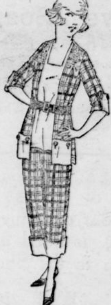
This smock dress has a two-piece skirt, which measures about 1 1/2 yards around the bottom. McCall Pattern 8868, which comes in four sizes, 14-20 years, price 25c.

The origin of moons is one of the mysteries of astronomy. If, as some star-gazers assert, our lunar orb was thrown off from the earth when the latter was a molten, fiery mass—the Pacific ocean being the hole left by its exit—a proprietary interest in it.