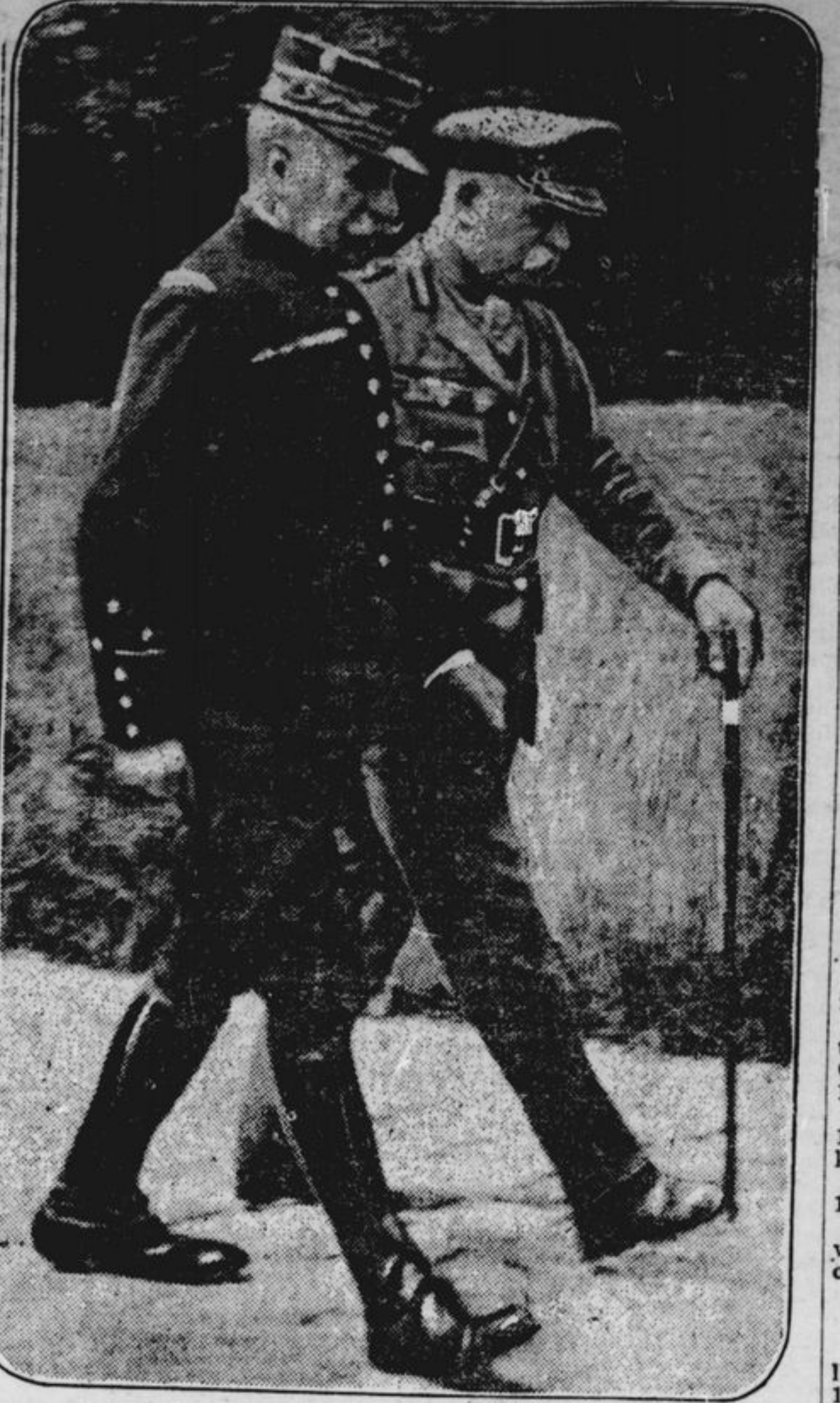
Gen. Foch, French commander of the army of the north, and Field Marshal Sir John French conferring at the headquarters of Gen. Foch. Gen. Foch, considered one of France's greatest strategists, is in absolute charge of the French army of the north.