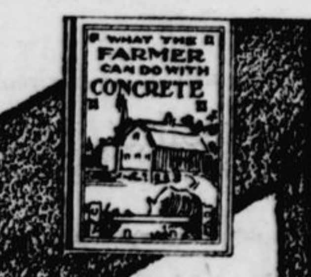
Write for a free copy of this book

There is a Canada Cement Dealer in your neighborhood—if you do not know him, ask us for his name.