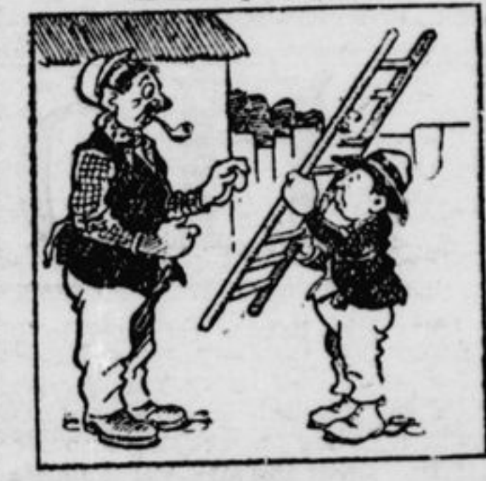
Useful in the House.

Smith remarked that a certain person in the musical world led a very abandoned life. "Yes," replied his friend, "the whole tenor of his life has been base."