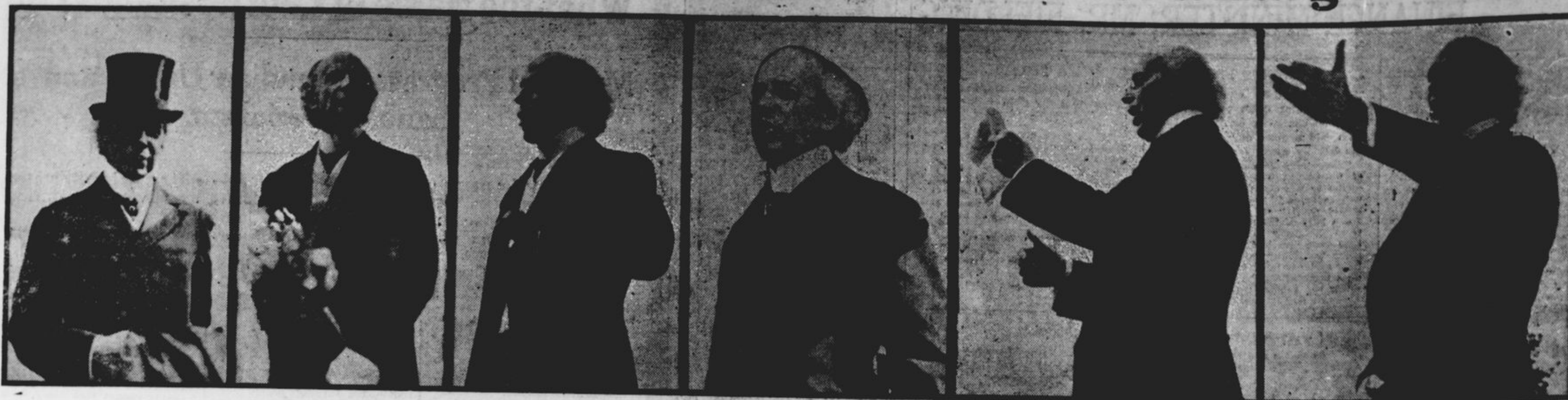
STRIKING SNAPSHOTS OF SIR WILFRID LAURIER TAKEN DURING HIS ONTARIO CAMPAIGN.