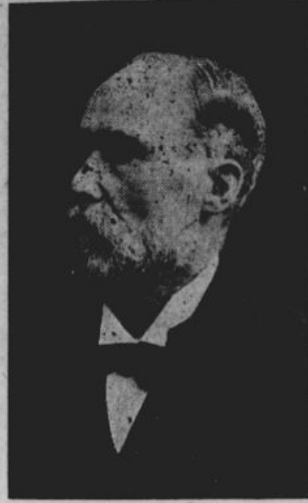
Senator G. W. Ross

Announcement is made this week that the Hon G. W. Ross has been elevated to the Senate, thus again entering the Dominion arena which he left in 1883 to become Min. of Education in Mr Mowat's cabinet. Few if any appointments to this body have given more satisfaction, or will add more to its usefulness.