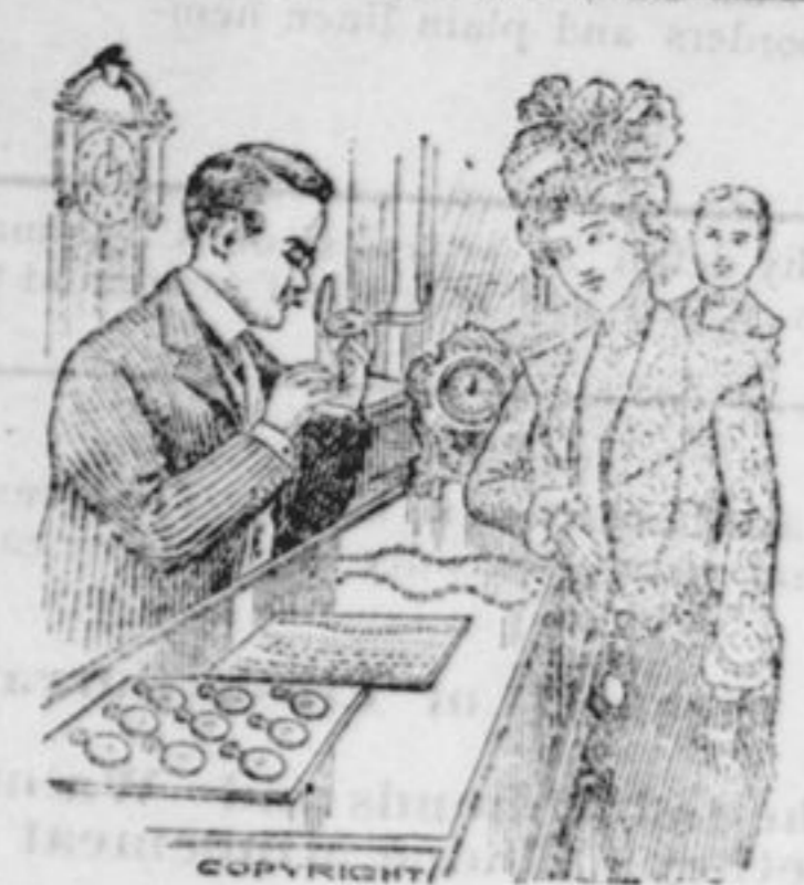
WATCH REPAIRING AND ENGRAVING our Specialty.