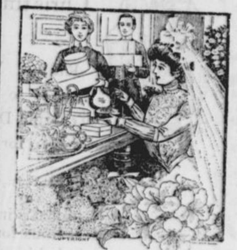
SILVERWARE & CARVING SETS Best Quality Goods.

Mantle Clocks, Fancy gold plated Clocks, Musical Alarm Clocks, Gold spectacles, Eye glasses, Hymn Books, Prayer Books, Psalm Books, Books of Poems, Miscellaneous Books, Picture Books, Christmas cards, gold mounted Umbrellas, cased Pipes, Tobacco Pouches, cigar cases, cigars put up in fancy boxes, Musical Instruments, Toilet cases, Dressing cases, Shaving sets, sleighs, Toys Dolls, Games, choice confectionery in fancy boxes, choice Perfumes in fancy cases. Burnt Leather Goods—see them, something new and up-to-date. They are certainly swell and very cheap.