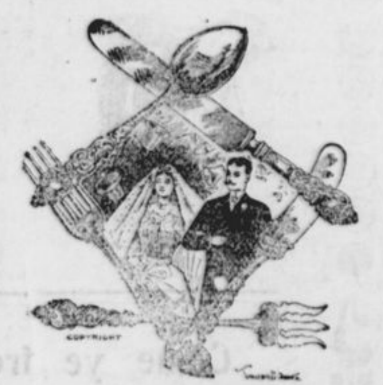
WEDDING PRESENTS In Striking Variety and Beauty