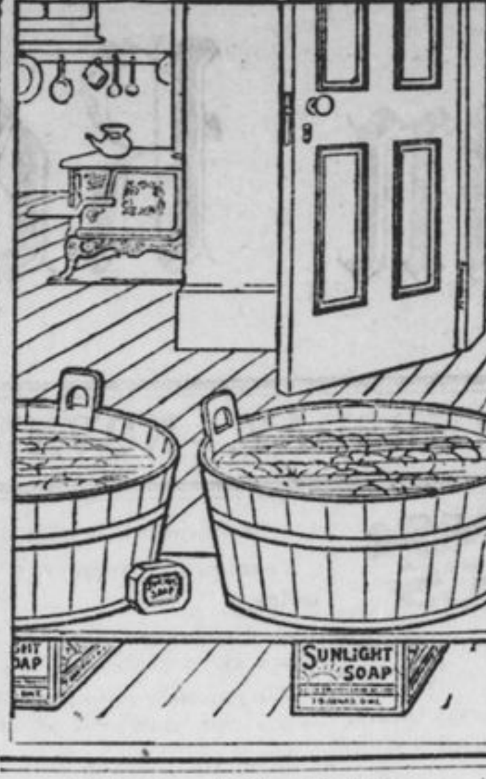
Footbal and Prize Fighting.

Don't Neglect A Cough. Many a case of chronic Bronchitis, Pneumonia and even dreaded Consumption itself, may be traced directly to "only a cough." GRAY'S SYRUP OF RED SPRUCE GUM. It cures COUGHS—beats the inflamed surfaces—possible condition to resist the trying effects of a Canadian winter.