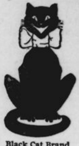
Black Cat Brand Chicago-Rockford Hosiery Company Kenosha, Wis.