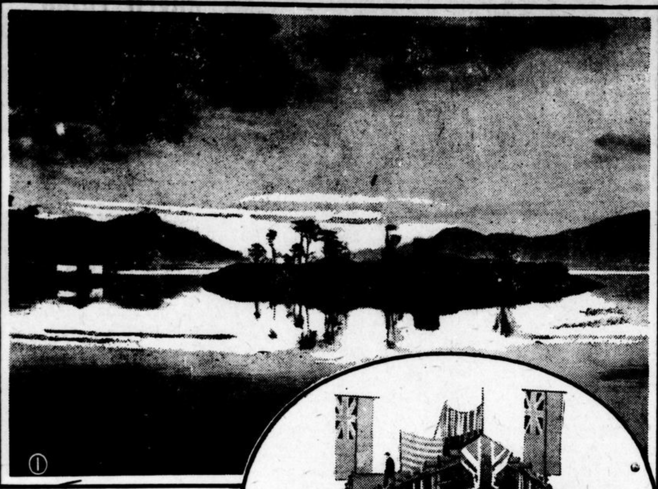
1. Gem like islets thrusting up from smiling summer seas. 2. The "Motor Princess" after launching.

The magnificent chain of fine motor roads which wind through the Selkirk and the Canadian Pacific Rockies to Vancouver and points on the southern British Columbia border, thence through the western states of America, touching as they do the finest of the Canadian and American National Parks, need no introduction to the world of motor-dom. Every mile of roadway, especially through the Canadian Parks where it has, in many places, been cut out of solid rock and at stupendous cost, has been built with an eye to easy travelling and scenic grandeur, and from early spring until late in the fall a continuous stream of automobiles, bearing licences issued in every town on the continent, pour along the highway. Nowhere else can the motorist obtain such a long run through such ever changing scenes of natural beauty.