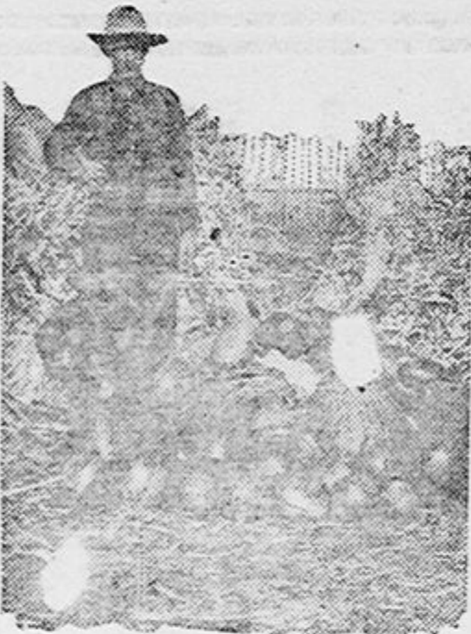
SOME RIPE MELONS.

Watermelon that is still undeveloped will show quite a white color where the melon rests on the ground.