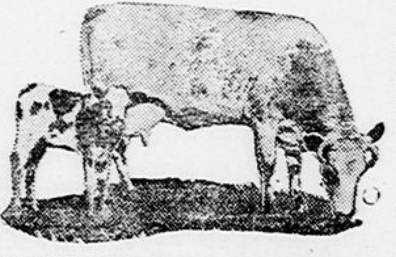
MILKING SHORTHORN COW ORPHA AND CALF OWNED BY THE MINNESOTA EXPERIMENT STATION.

OF all these the most popular is the dual purpose Shorthorn. In this breed the characteristics of the beef bred Shorthorn have been somewhat modified in order to develop the milking qualities. The cows are longer