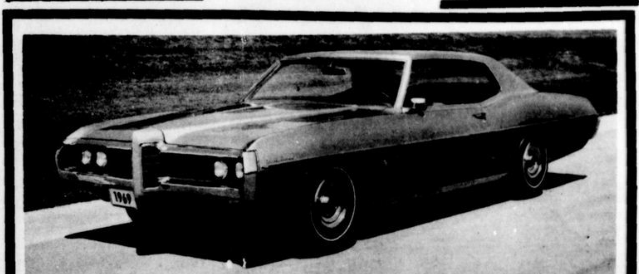
1969 PONTIAC PARISIENNE SPORTS COUPE