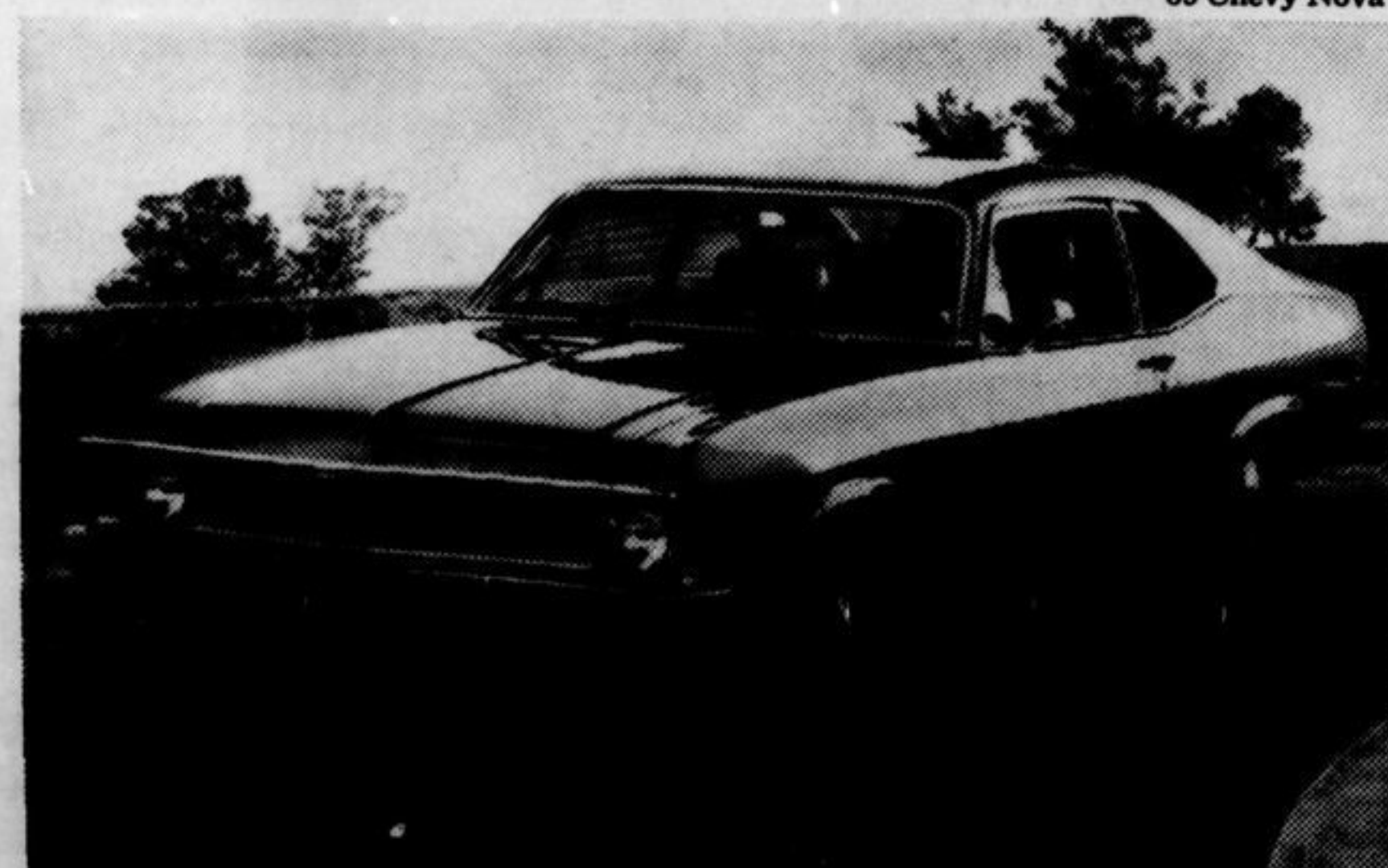
'69 Chevy Nova

Think of the '69 Chevelle as 'concentrated Chevrolet.' It's got Big Chevrolet features, but a naturally active personality all its own. Just add gas—and let the other mid-size cars step aside.