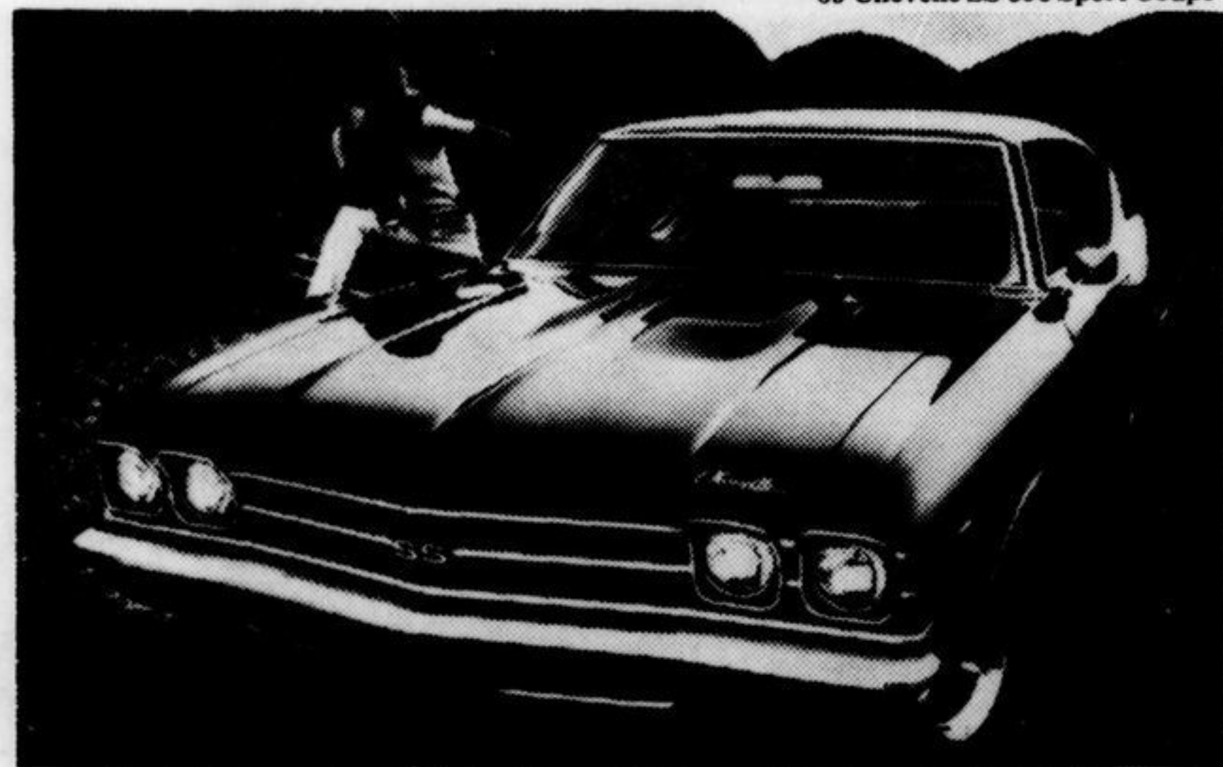
'69 Chevelle SS 396 Sport Coupe

Just look how the '69 Hugger hangs together. Not a line that isn't leaning into the wind. We've improved the interior, too. Quieted the ride. And made the Astro Ventilation ventilate even better. No wonder the other sportsters are gnashing their gears.