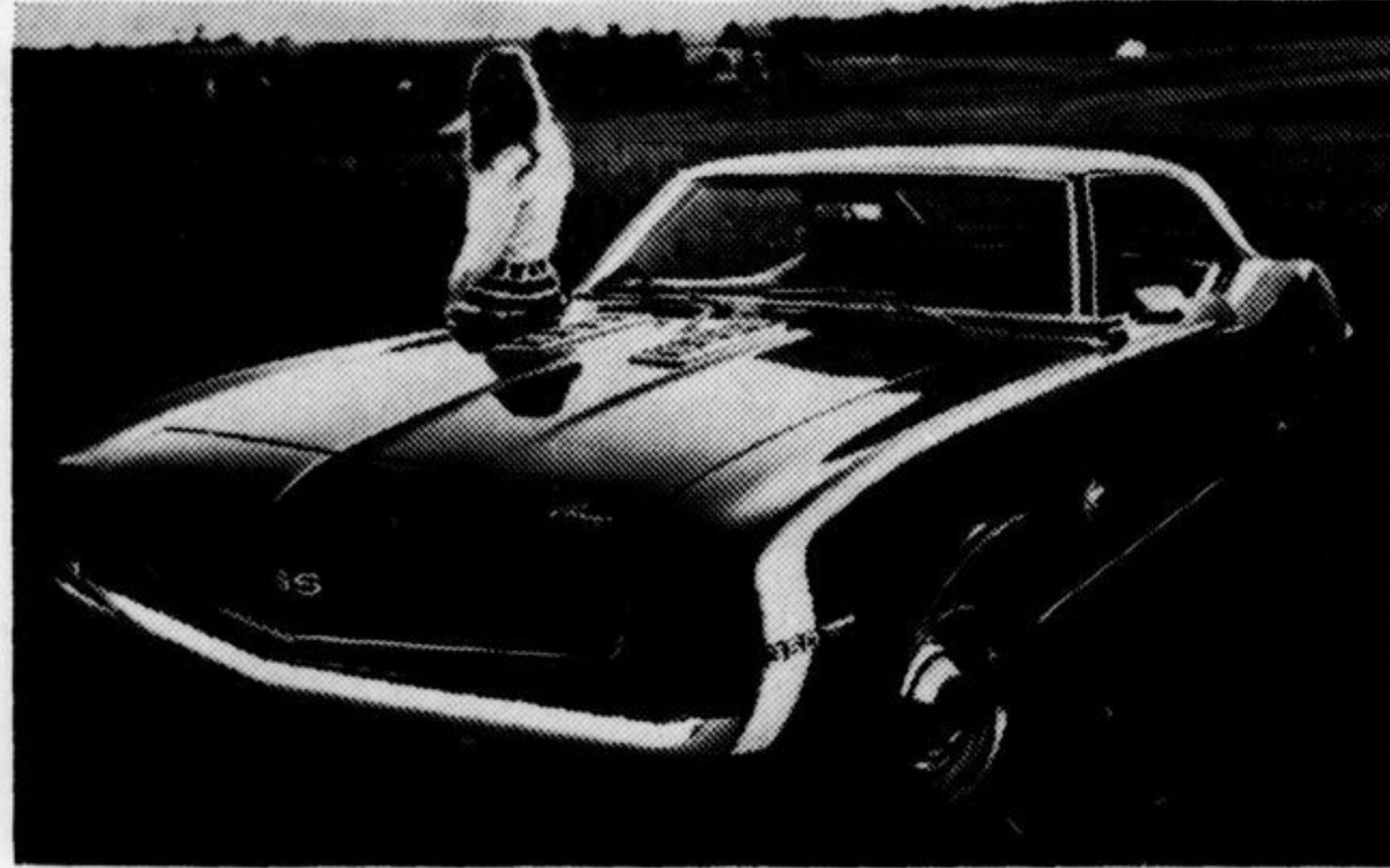
'69 Camaro SS Sport Coupe, plus RS equipment

Should we have made the '69 Caprice shorter? Or adorned it with flashy nicknacks? Should we have skipped the bigger new 327 cu.-in. standard V8 engine, the added interior elegance, and the improved Astro Ventilation System? Some people think so—our competitors.