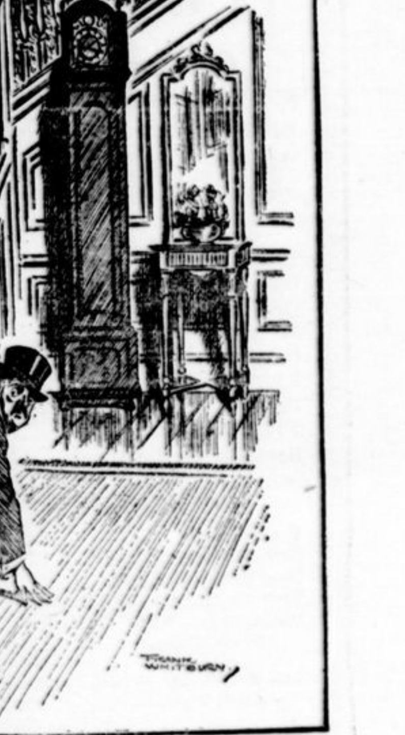
"What are you doing, Henry?" "S all right, m'dear. I've been to a myshtery p-play, an' it's given me the hic-creeps!" —The London Opinion.

It will pay you to advertise in The Chronicle.