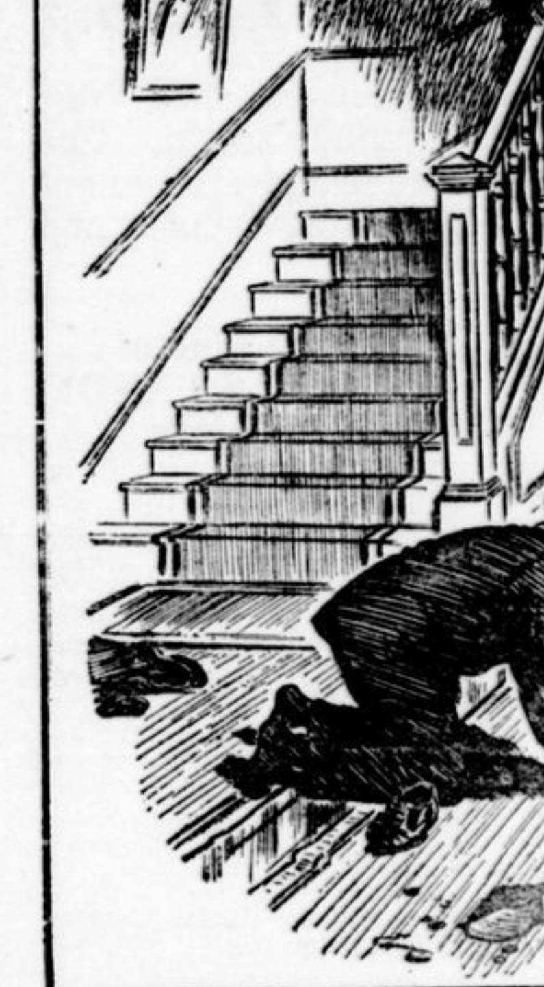
"What are you doing, Henry?" "S all right, m'dear. I've been to a myshtery p-play, an' it's given me the hic-creeps!" —The London Opinion.

It will pay you to advertise in The Chronicle.