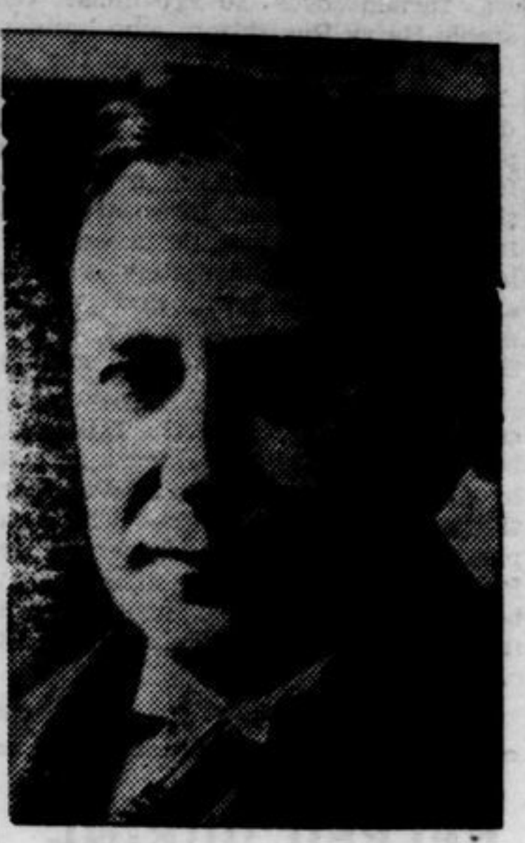
EX-AMBASSADOR EXILED M. Rokovsky, former Soviet Ambassador to Great Britain and to France, who has been exiled to Siberia after his arrest by Soviet Secret Police. He has been taken to Barnaul, 200 miles southwest of Tomsk.

That overcrowding in prisons is one of the primary underlying causes leading to prison riots and attempted jail breaks was the opinion expressed here today by United States Attorney-General William D. Mitchell in a speech broadcast by radio.