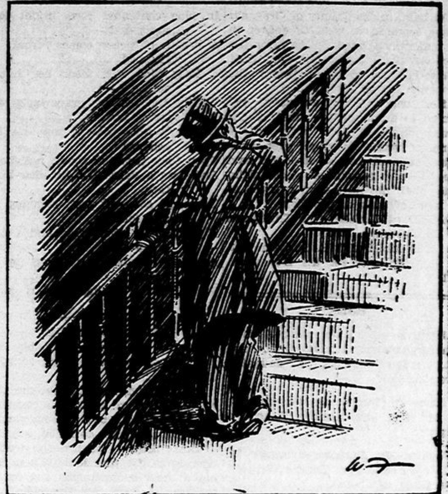
HUSBAND (fearfully): "Maria, m'dear! Beashly eshcalator's broken down." —London Opinion.

Preparedness A drug store in Oklahoma City advocates preparedness with this sign above its soda fountain: "Take home a brick. You may have company."