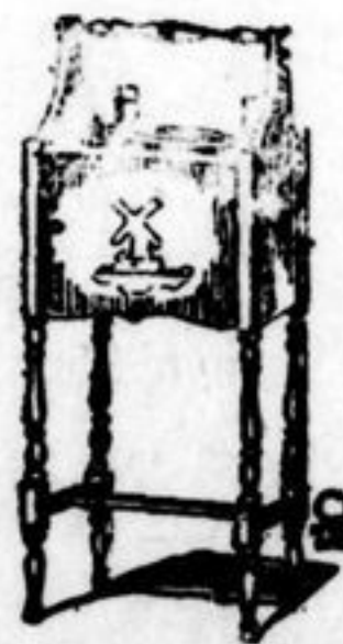
Smoker WITH METAL lined humidur and very complete smoking equipment. Finished in walnut. $1.90 to $5.00