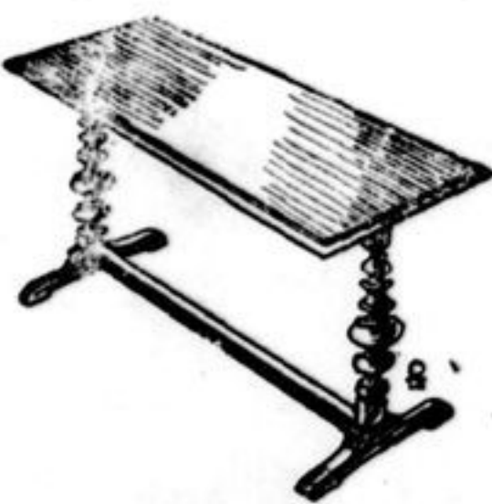
Chesterfield Tables SPLENDIDLY fashioned Tables for Living room use. $4.50 to $14.00

BELOW we price and describe a few appropriate gift suggestions for the home. Such gifts are truly appreciated—and their small cost is apparent from these specimen values.