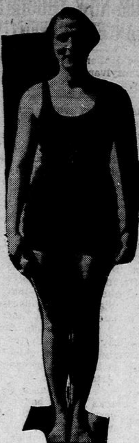
Miss Ethel Hertle of the Bronx, New York, who won the women's division of the third Wrigley swim marathon in Lake Ontario. She received $10,000 for the ten mile swim.

The different kinds of lace-wing flies are good friends of the gardener: their larvae feed partic-