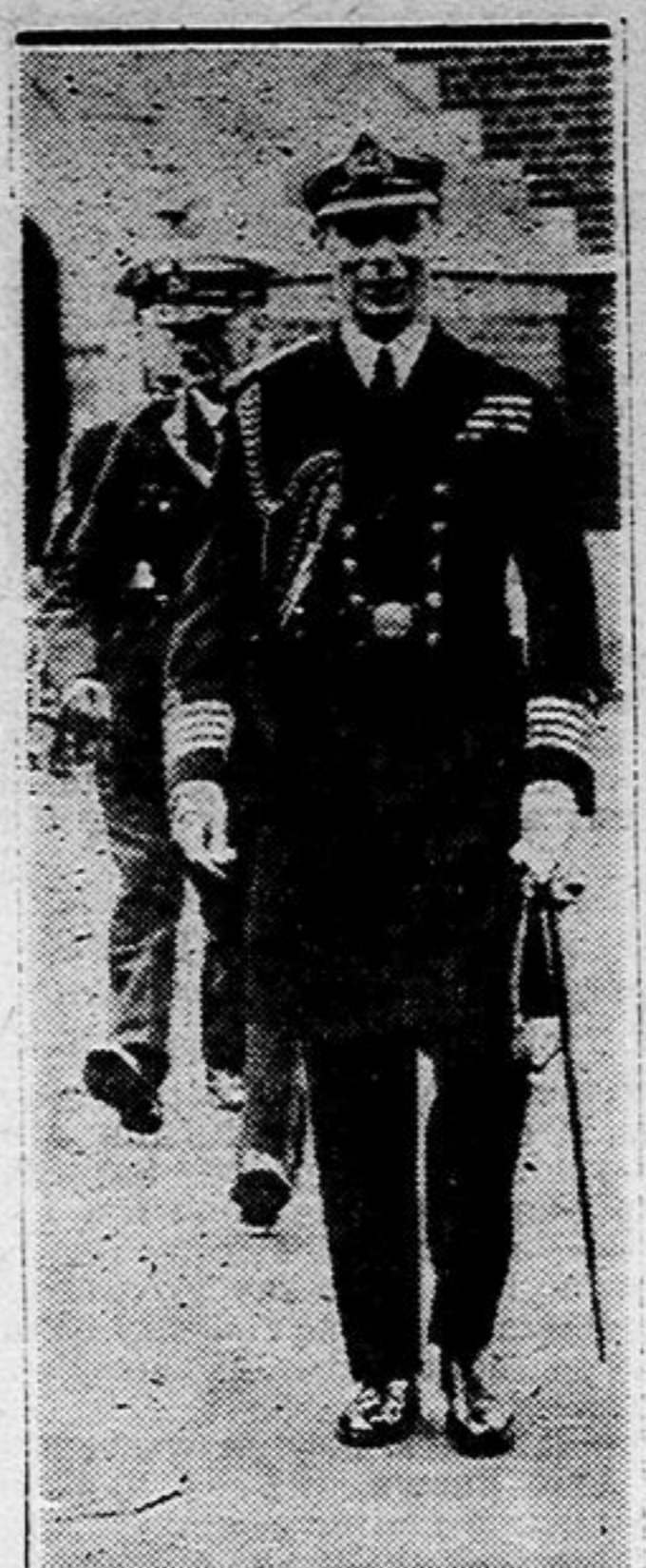
The most recent photograph of Prince Henry, the Duke of Gloucester, who will accompany the Prince of Wales on a trip in the autumn to British Africa.

When forced to push another car out of the way with the car, see to it first that the obstructing car is not in gear and that the brakes are not applied.