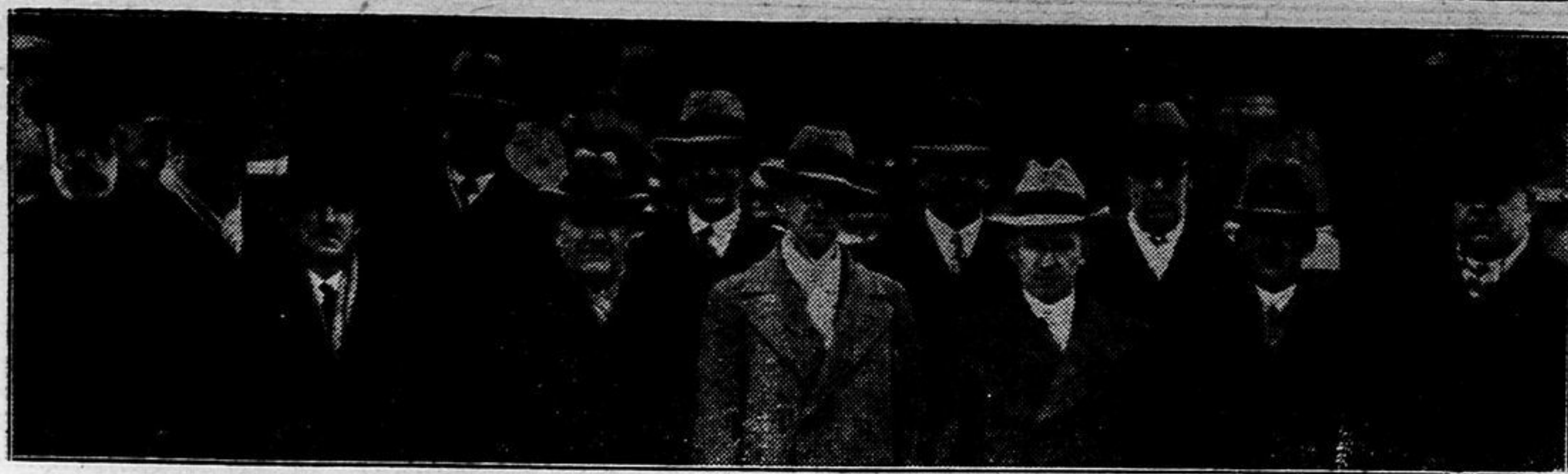
WINDSOR'S LAST 13-MAN COUNCIL