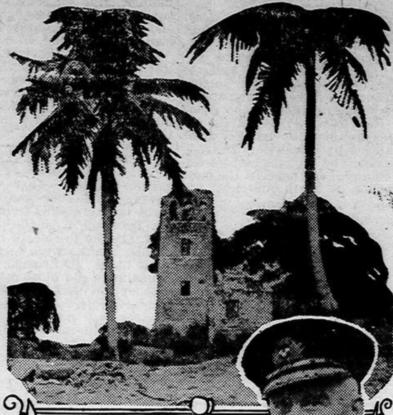
RUINS IN OLD PANAMA