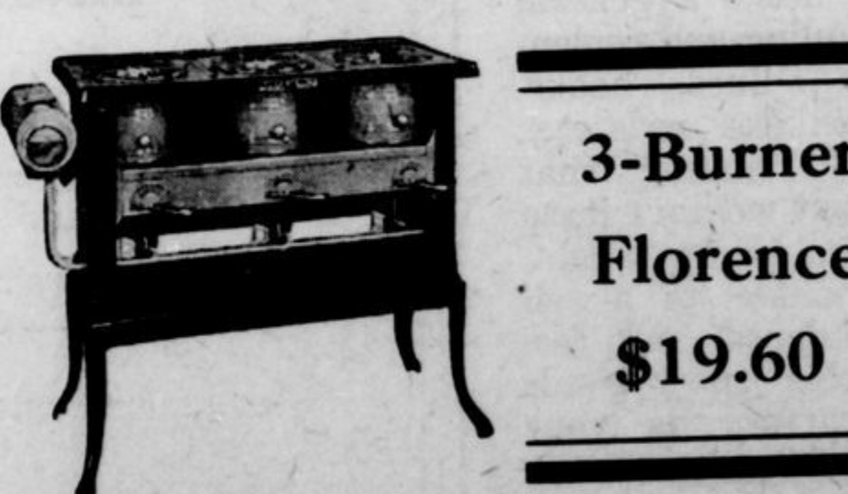
3-Burner Florence $19.60 Cross & Sutherland Hardware Co., Limited

Wonderful advances have been made in the perfecting of oil appliances and in the "Florence" Oil Stove you have the final word in practical efficiency and convenience. "Fumes, smoke and odors" are things of the past. The principle on which the "Florence" operates not only means absolute safety and cleanliness, but gives you all the advantages combined in the most modern coal, gas or electric range. For hot, sultry days when a cool, clean kitchen is so desirable, the "Florence" is a veritable boon to the housewife. It fits so readily into every household arrangement—the farm house—the summer cottage—the city home.