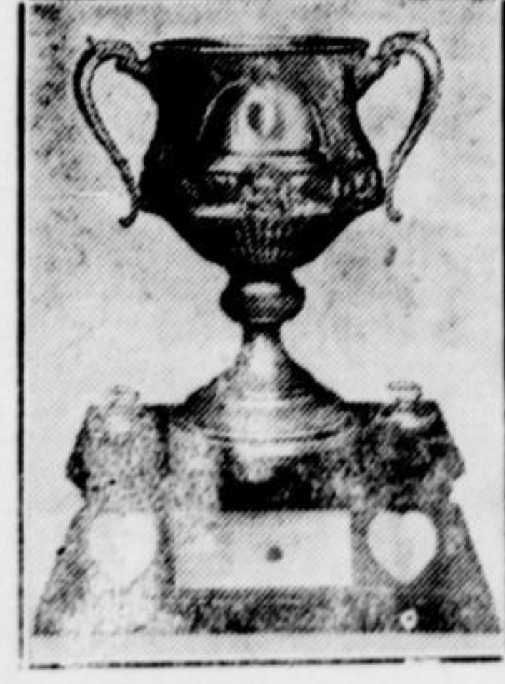
THE MACDONALD CUP The premier curling trophy of Canada, which goes to Halifax for a year. It is the first time that the cup has travelled East.