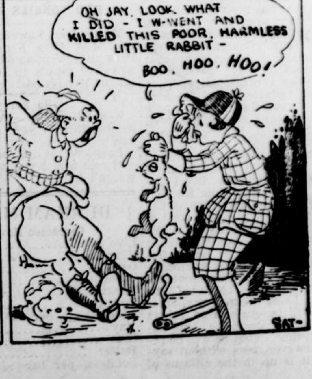
The Brave Huntress