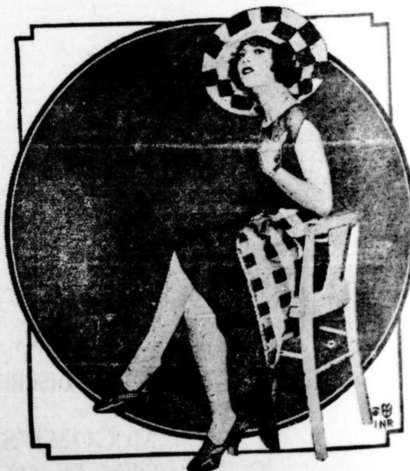
IF FRIEND wife comes home one of these days all "dolled up" in the checker-board fashion pictured above—blame it on the Cross-Word puzzle fad. But—do control your temper. Because women will be dressed up in the latest styles, regardless of what you say. And this is—THE Latest! The hat—the newest in Millinery—is known as the "Cross Stitch" Hat. And the scarf—shown wrapped around the model's waist—is made of material to match the hat. This cross stitch is making a strong bid for popular favor with the women folks, and recalls the days of the cross stitch craze some years ago.