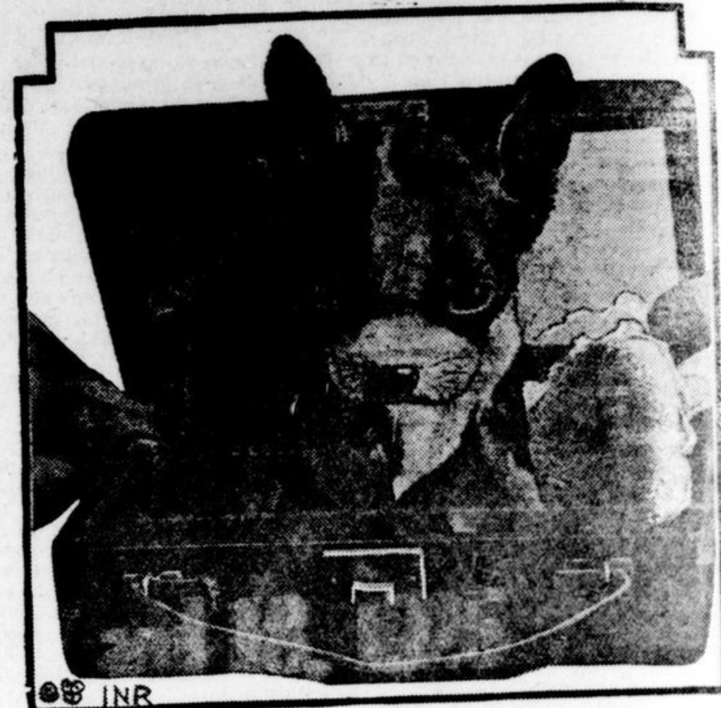
WOOF! G-r-r-r. Look out—mashers and purse-snatchers. This little beast weighs one whole pound and is carried by an eastern Miss in her vanity case for protection. If, by chance, some bold man should grab the case, the cover flies open, and "Tiny"—this two-month-old Boston Bull pup—does his stuff. G-r-r-r. Woof! Woof!