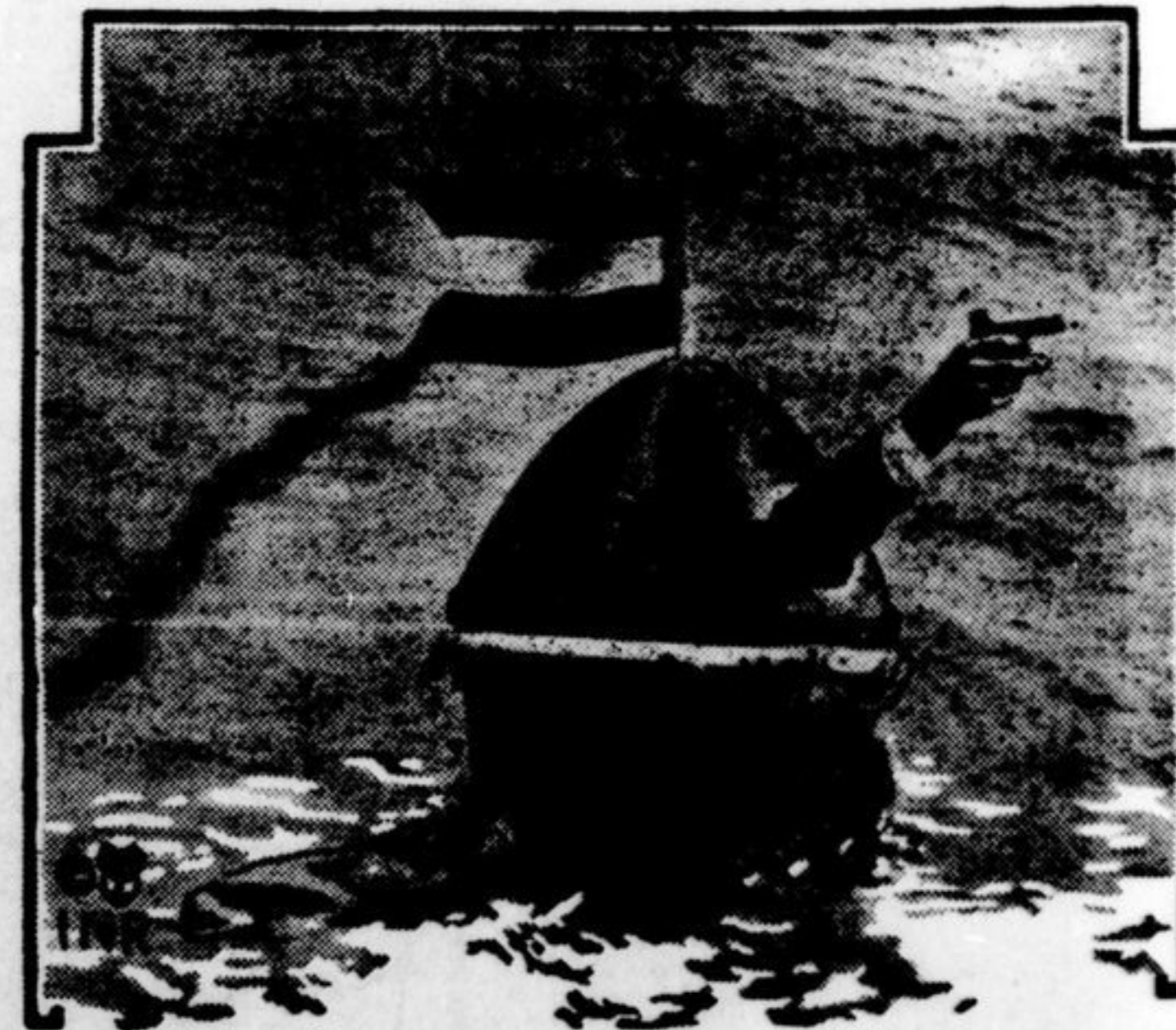
PRACTICAL tests—such as shown here—are being made over in Germany of this newly invented life buoy for use at sea. It cannot sink, and is capable of maintaining a person for several days until calls bring help. The body of it has a water-tight window, and its interior is equipped with a receptacle for food and a pistol for signalling. The photo shows the pistol being used for signalling through the window.