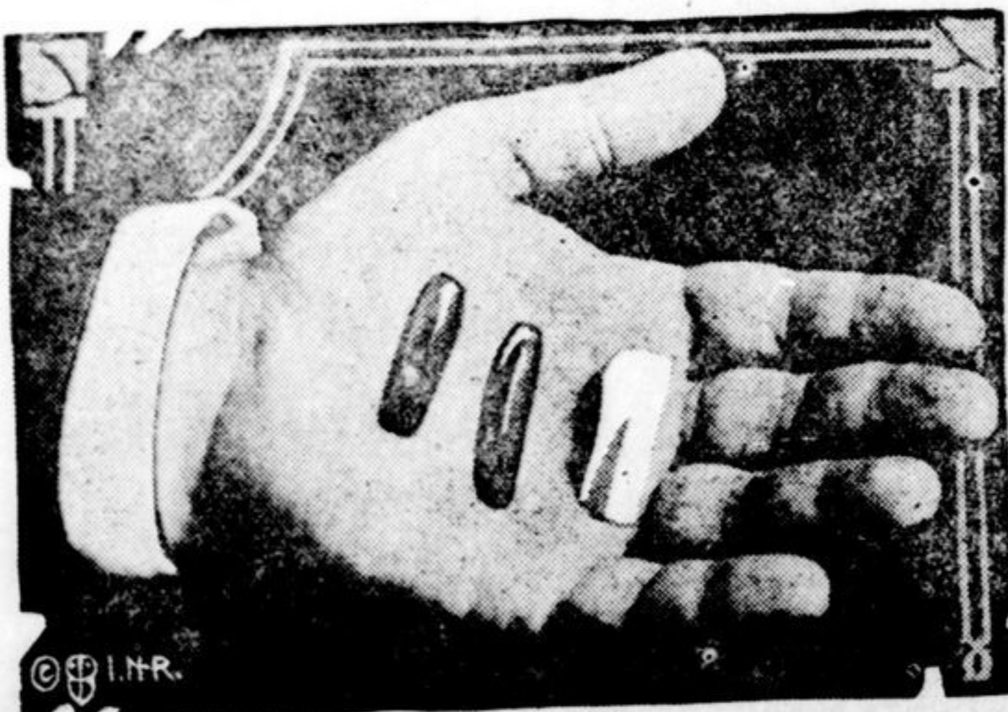
COMIC ARTISTS have always pictured men of the stone age and shortly thereafter, with big mops of hair and long, flowing beards—thereby creating the impression that those old timers never shaved and had no idea of what a razor was for. That natural supposition has now been discredited. Those tiny objects shown resting in the hand above are razor blades said to be more than 6,000 years old. They were found by a joint expedition of the University Museum, Philadelphia—at Ur of the Chaldees, Babylonia. The blades were chipped from Obsidian and were located in the graves of the Sumerians.

Interesting Events the whole World over as seen by The Chronicle Photo News Ser- vice.