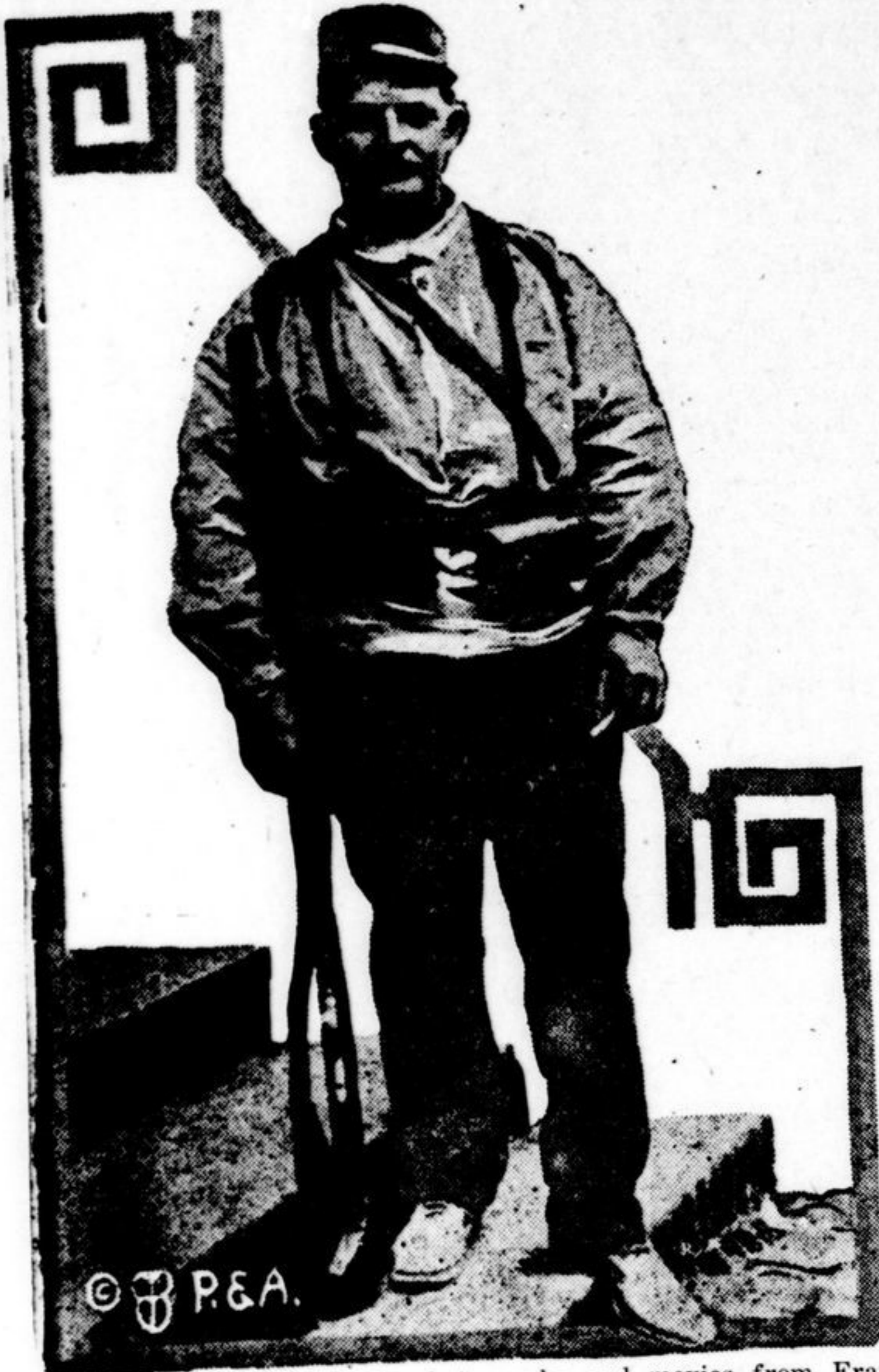
PRESS DISPATCHES, photographs and movies from France continue to extol the popularity and esteem with which the new premier, M. Herriot, is held by the French proletariat. Wherever he appears he is cordially received and greeted and his appearance as premier under President Donmergue was favorably accepted in all political circles. The rare photo above, however, is one that but few people have ever seen of him. It was taken fifteen years ago—in 1909, to be exact—at the time Premier Herriot was a member of the French Military Reserves. He was known then as Edouard Pitou, the latter name being Argot—something akin to the British "Tommy."