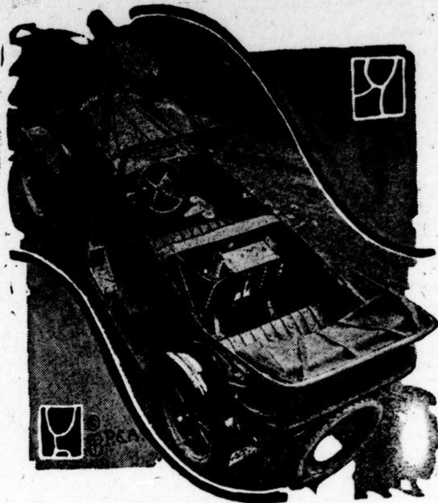
ENGINEERS of the Automotive Power Plant section of the Bureau of Standards at Washington, D.C., have just completed the above pictured apparatus for obtaining data on the road performances of autos. The periscope-like contrivance shown near the front of the car is to be used for measuring the relative air speed the car travels. In front of the rear seat is a device with 18 automatic pens in its workings for recording any incidents that occur while the car is in operation. The unique outfit also has a camera in it for photographing the flow of gasoline in the carburetor.