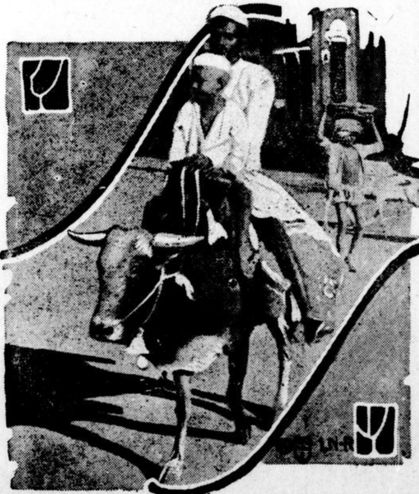
OXEN still play an important part in the life and customs of natives in the ancient city of Gwalior, India. Not only for plowing and hauling purposes, but equestrian activities, too. The photograph here shows an Indian with his son astride a docile ox. Of course, it's not what you would call "rapid transit," but then—the people over there have all kinds of time and they get there just the same. One there consolation, at least, in this method of transportation. It may be slow, but you're safe from reckless drivers in crossing the streets. Then, too, there's no "high cost of gasoline."