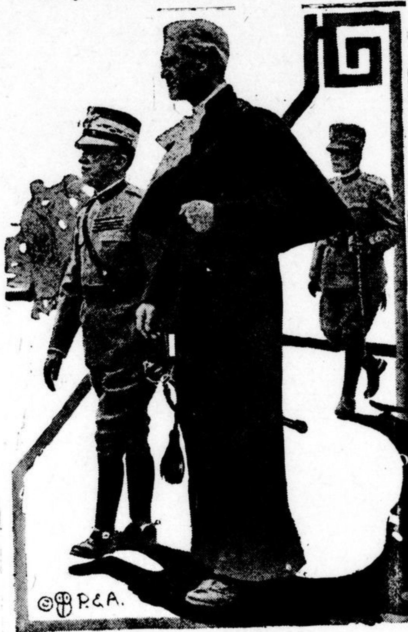
PUBLIC DEMONSTRATIONS of an exceedingly friendly nature greeted the King and Queen of Italy on the occasion of their recent formal visit to England. They were the guests of British Royalty and their visit was marked by much pomp and ceremony—such as the British populace had not been treated to in many a day. One of the many interesting places to which the Italian king and queen were escorted was Westminster Abbey, where the above picture was taken. It shows King Emmanuel leaving the Abbey accompanied by Canon Carnegie. Note the difference in stature between the tall, venerable-looking English clergyman and his royal guest.