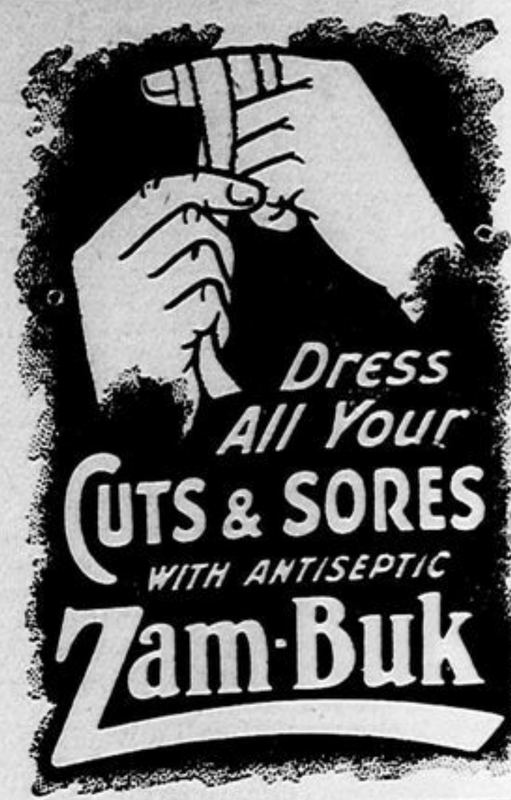
Dress All Your CUTS & SORES WITH ANTISEPTIC Zam-Buk

Advertisements under this head CASH WITH ORDER; six consecutive days of four. Telephone calls treated as Saturday night of week ordered. 25 cents. On all charge orders a minimum will be made each insertion, minimum.