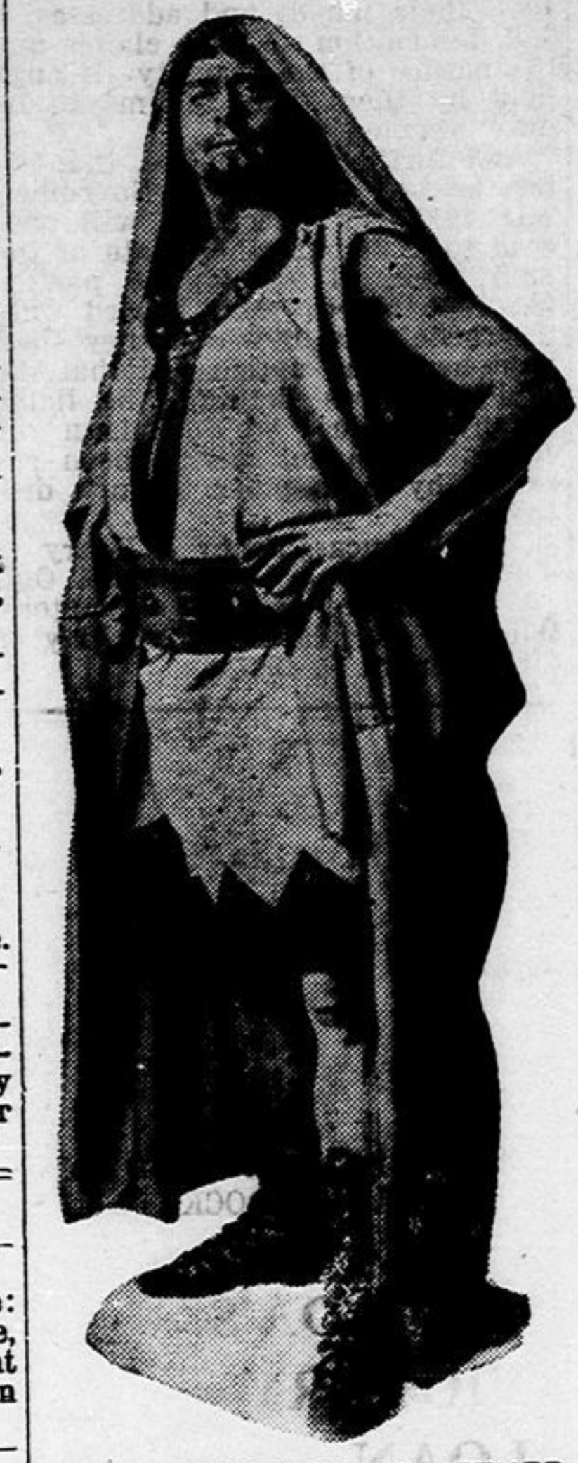
GAAL, BROTHER OF JETHER. Gaal Cast an Angry Glance at the Mocking Jether.

than that I would share a crust with any beggar on the road. Father, I would not hurt thee, but thou canst not see beyond these hills. Thou canst not understand how one might wish to live afar." "My son, what meanest thou?" inquired Jesse, amazed. "I am a man in all eyes save thine," continued Jether wildly. "The things I feel are what a man feels. Yet here I am nothing. Not only thou, but Gaal, whom I defeat, would be my master. I tell thee, father, no man shall be my master."