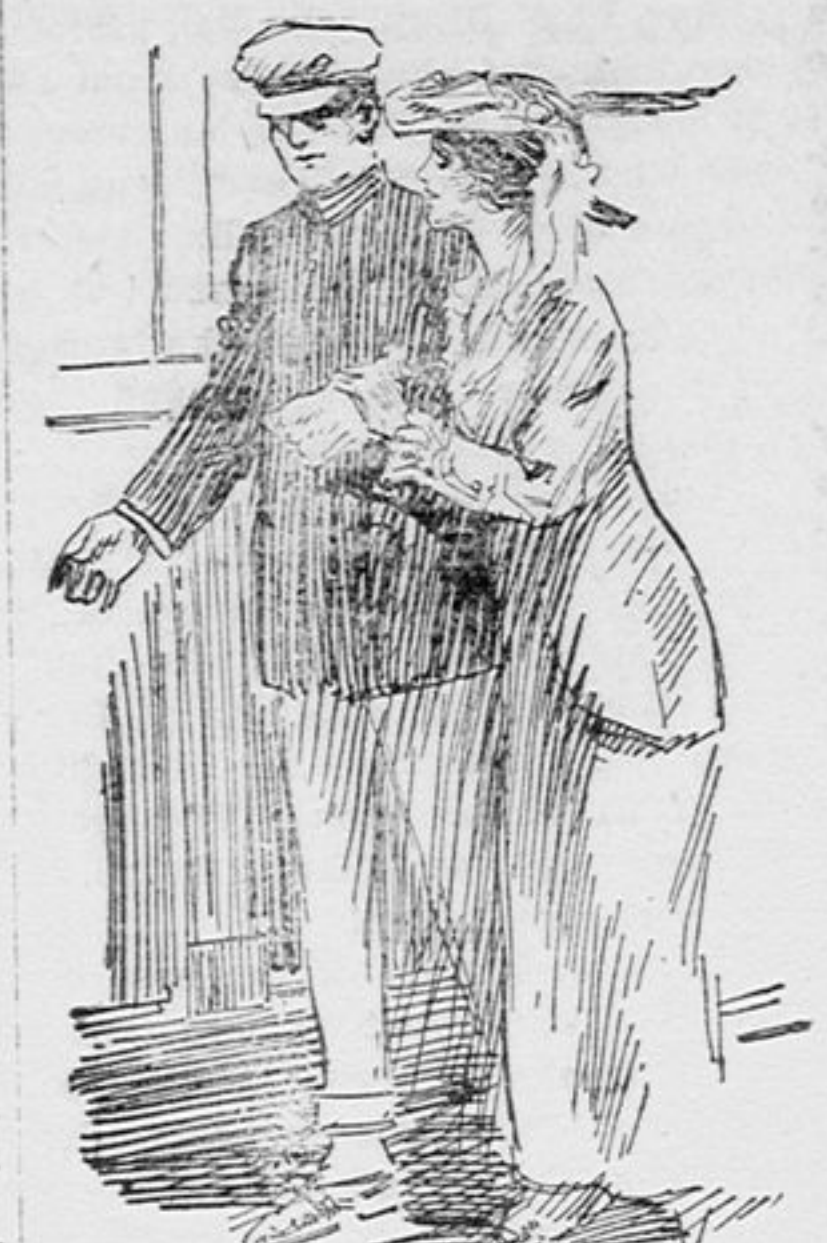
"No, No, No! Take Me Away—To the Kohinur—at Once."

her lips were colorless. He sprang promptly to her assistance, and she instantly transferred the sustaining hand to his wrist, which she clutched spasmodically. "What is it?" he demanded solicitously, yet with a restraining thought of the ease with which any crowd's attention is attracted. "What has happened?"