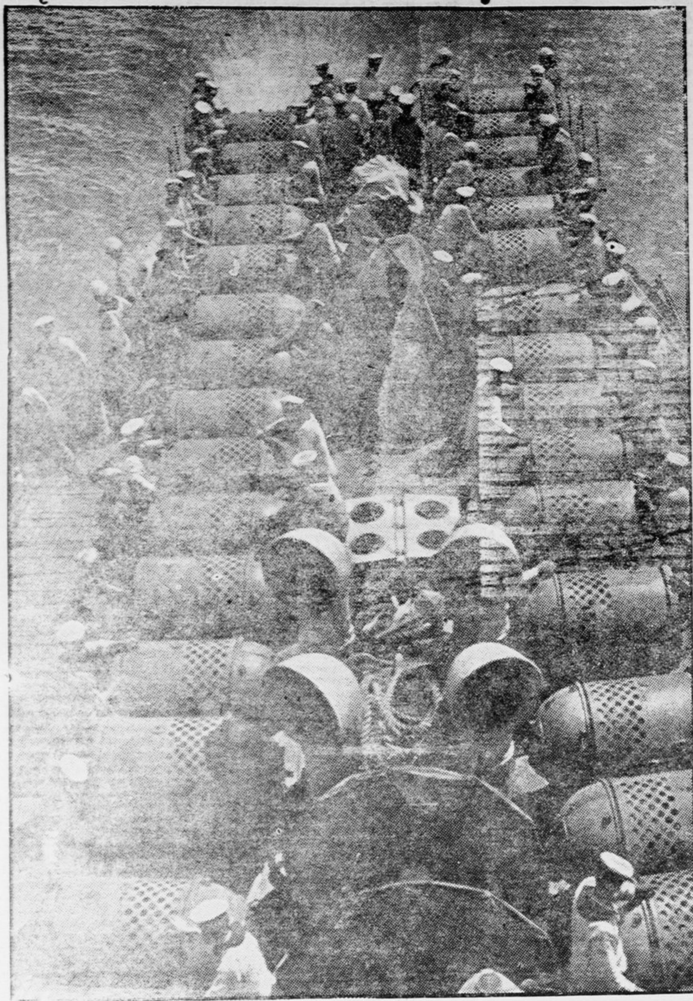
ITALY'S NAVY IN THE WAR: LAYING MINES ON A MINE-FIELD.—Completeness of organization and equipment in every detail is the Italian guiding principle in regard to every thing to do with both their army and their navy. Before the war, indeed, the thorough-going efficiency of the navy was specially marked in every respect. In the opinion of official experts, its "battle worthiness" was far above fleet's apparent strength numerically in all classes of fighting craft. The Italian navy's efficiency in the war with Turkey in 1912-13 surprised Europe. One of the departments in which the Italian navy has for years shown marked progress is in every thing to do with torpedo, submarine, and mining work, with which the subject of the above illustration of an Italian mine-layer at work has to do. In the photograph, a mine-laying vessel is seen under way, at work sowing her freight of mines on a mine-field. The mines are shown ranged along the sides of the vessel. All are in readiness to be dropped overboard at carefully charted points along the vessel's course.