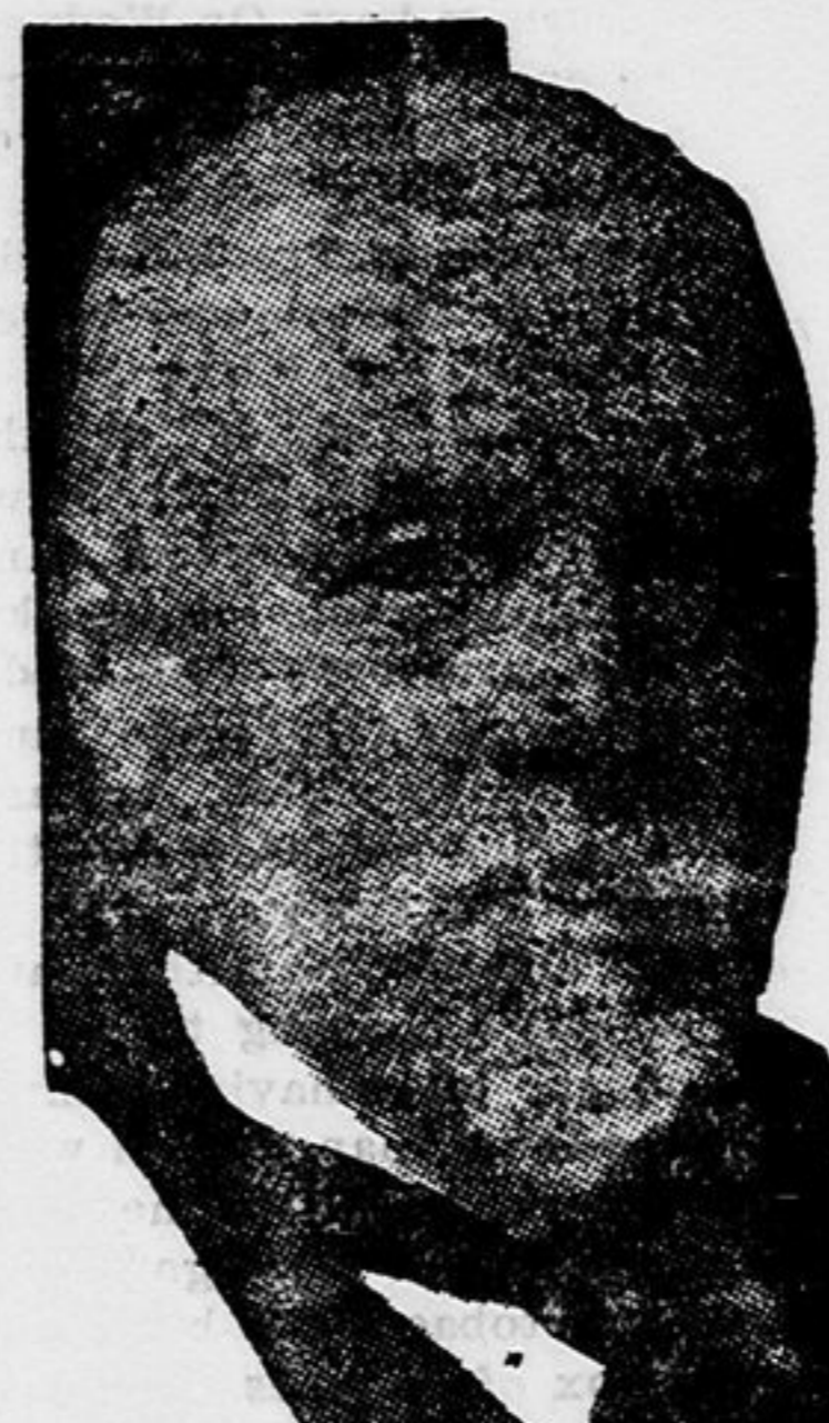
Dr. Wm. H. Welch.

The apparatus consists of 32 tubes contained in a glass case. The tubes, made of a substance called celloidin, are connected at one end with a single tube which may be attached to an artery, and at the other with a tube which leads to a vein.