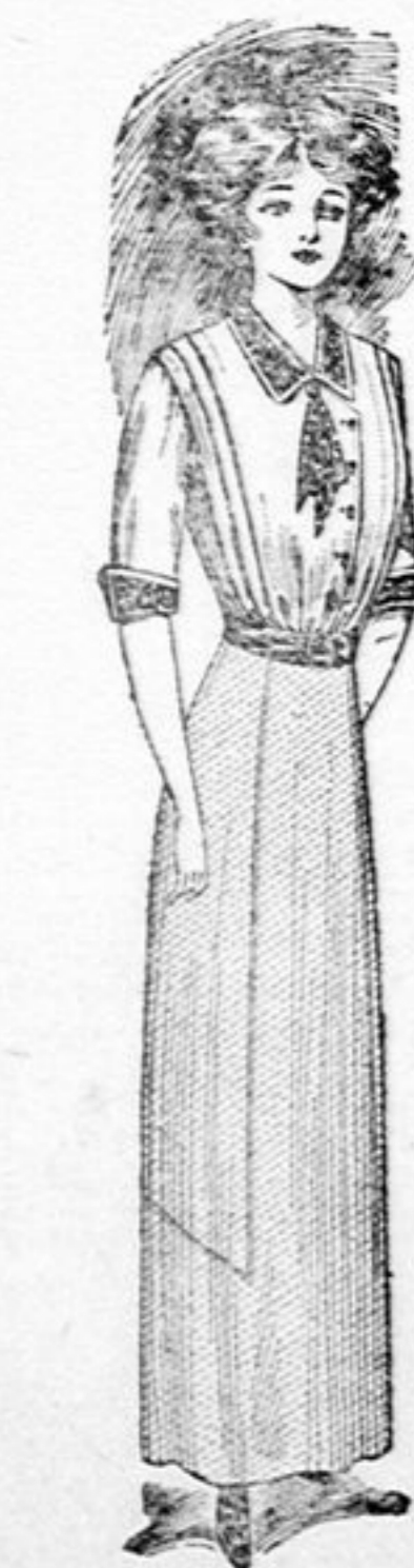
6078—Ladies' Waist Sizes 32, 34, 36, 38, 40, 42 inches bust measure.

Lace and Madras Curtains in great profusion in the newest styles and in the neatest patterns. The newest designs in Linoleums, Tapestry Squares and Carpets. The Wall-paper is so large and varied that it needs only to be seen to be appreciated. Your inspection is invited.