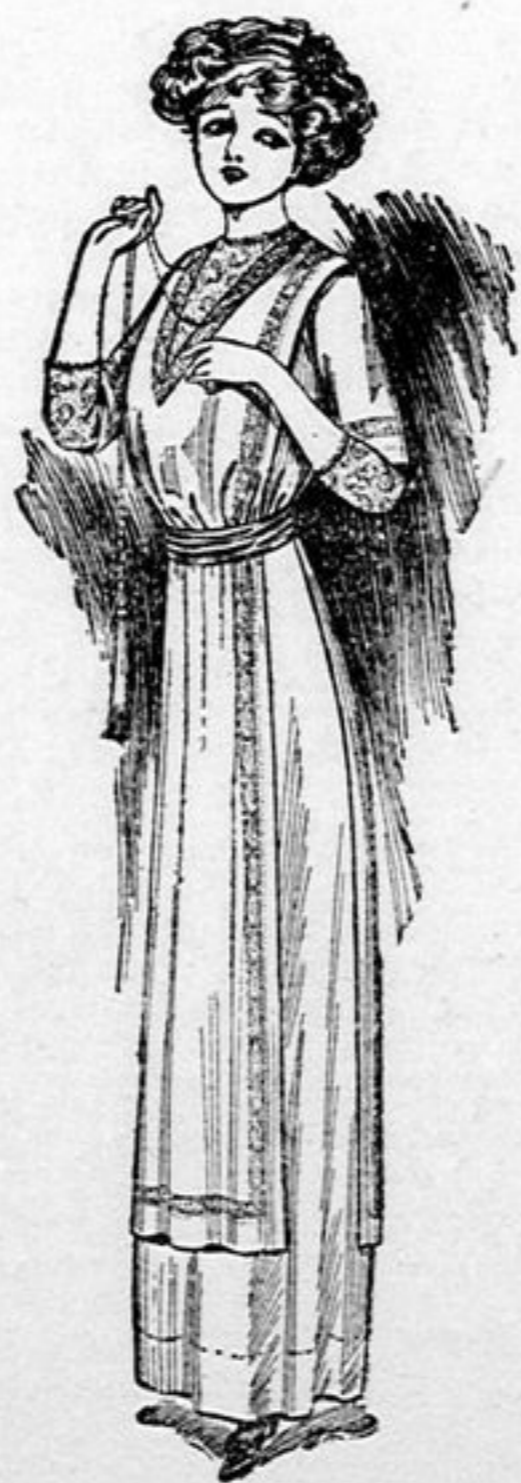
6051—Ladies' Waist Sizes 32, 34, 36, 38, 40, inches bust measure.