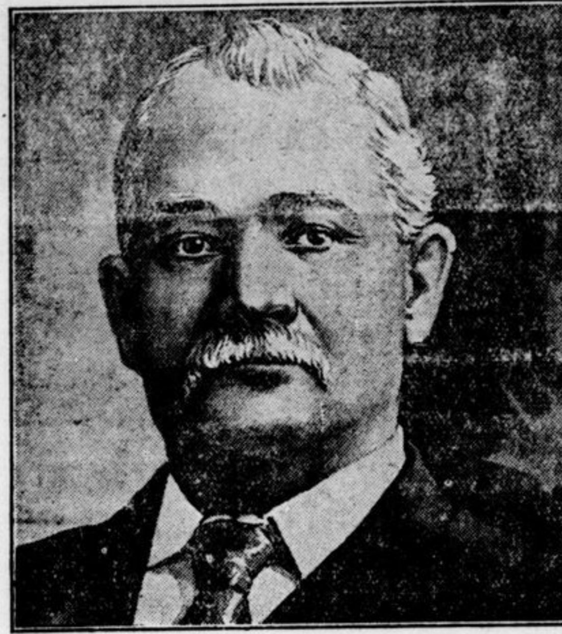
SYDNEY MINES, N. S., JANUARY 25TH 1910

"For many years I suffered torture from Indigestion and Dyspepsia. Two years ago, I was so bad that I vomited my food constantly. The agony I endured all these years, I cannot describe and I lost over 25 pounds in weight. I also suffered with Constipation which made the stomach trouble worse. I consulted physicians, as I was afraid the disease was cancer but medicine gave only temporary relief and then the disease was as bad as ever.