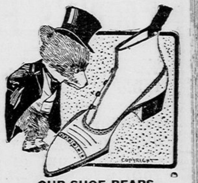
OUR SHOE BEARS the mark of quality from toe to heel. You know at a glance that they are footwear of high class. But style and good taste are not their only points.