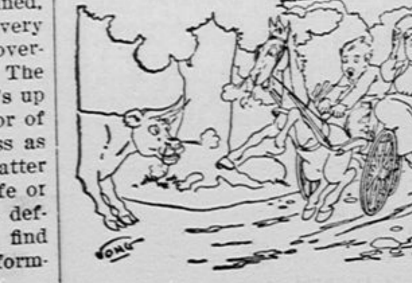
She has a very fine voice.