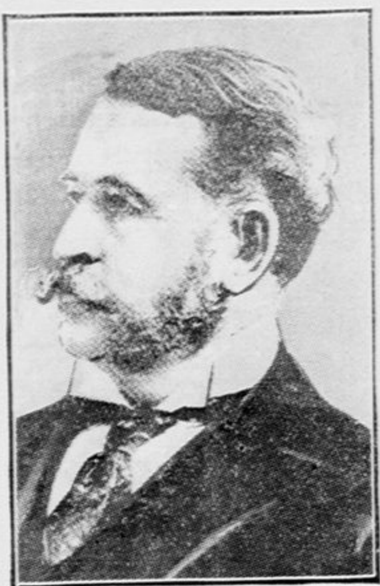
HON. J. P. WHITNEY Premier of Ontario

The Whitney Government Again Elected with a Majority of 70 Out of a Total of 106 Seats, the number of Conservatives Returned is 88, Liberals 17, and Laborites 1.