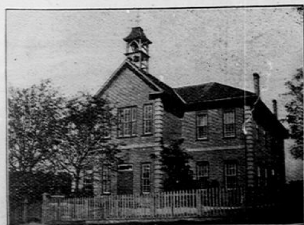
The Durham Model and Public School with High School Equipment.

If you want your business looked after in a prompt and satisfactory manner, you cannot entrust it to better hands.