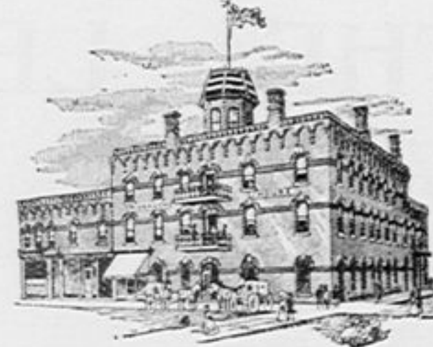
The Middaugh House.