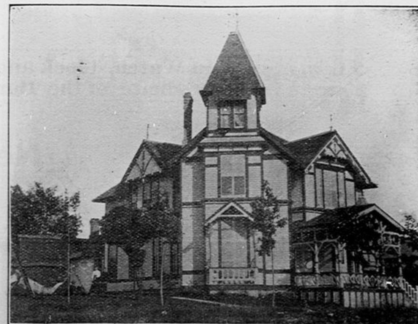
Residence of Mr. W. Laidlaw.

cover this part of the country. No effort has been spared to meet the wishes of the patrons of this house. His aim has always been to meet the approbation of all who put up there, and with this object in view he is continually adding to the comfort of the public. The table of the Middaugh House is not surpassed by any hotel in Western Ontario. In the sample room you are always assured of the best of wet goods, domestic and imported cigars. There are extensive sample rooms and every comfort provided for the accommodation of the public. The house is well heated, well lighted and has ideal guest chambers. Everything thoroughly up to date. Good stabling and an attentive hostler in connection. Personally Mr. Miehhausen is deservedly popular with the travelling public, and no less so with the townspeople and farming community. When in town do not fail to give the Middaugh House a call. Rates, $1.50 per day.