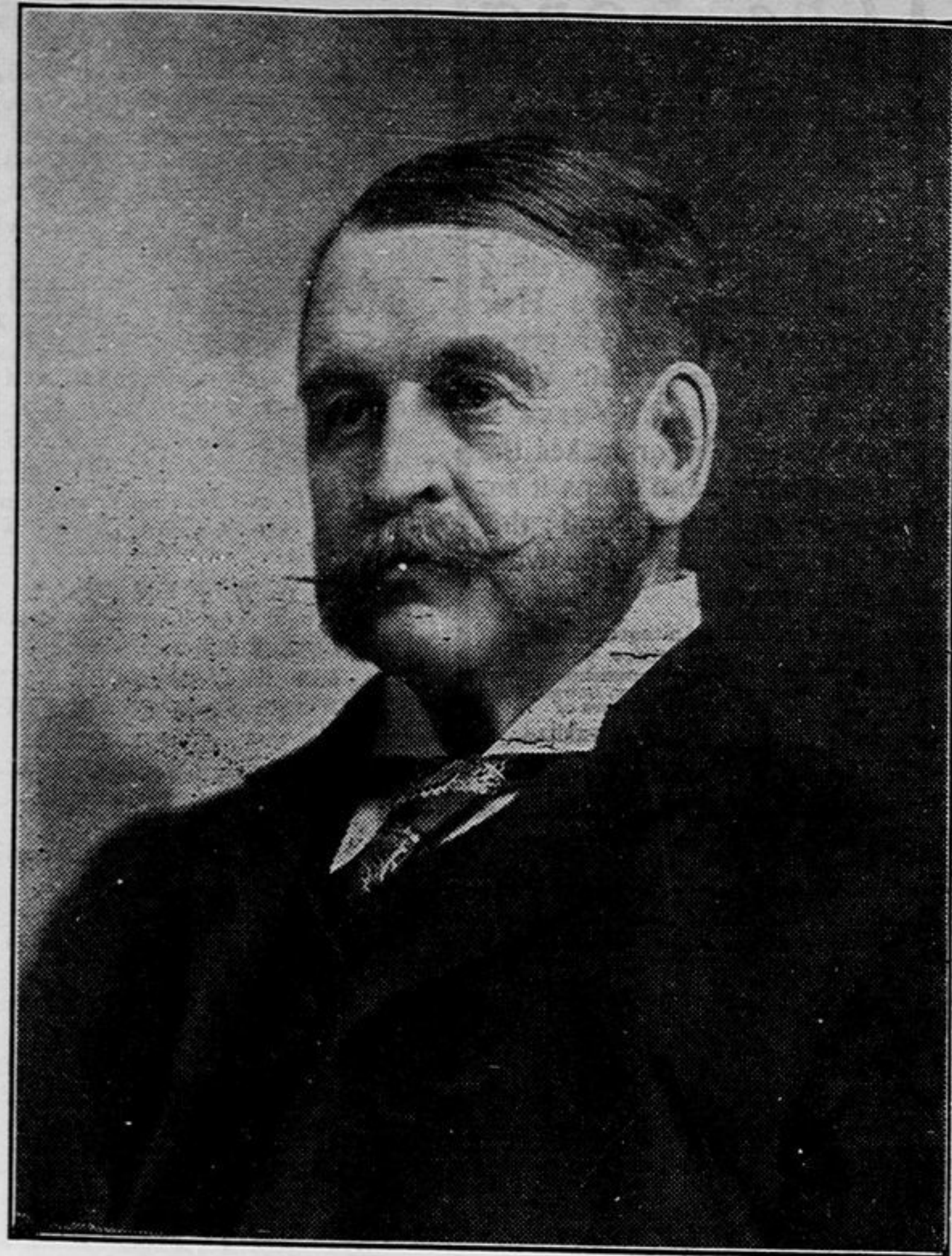
Hon. J. P. Whitney, Premier of Ontario. Will be in Durham June 21 at Oddfellows' Demonstration.

To Cure a Cold in One Day. Take Laxative Bromo Quinine Tablets. Seven Million boxes sold in past 12 months.