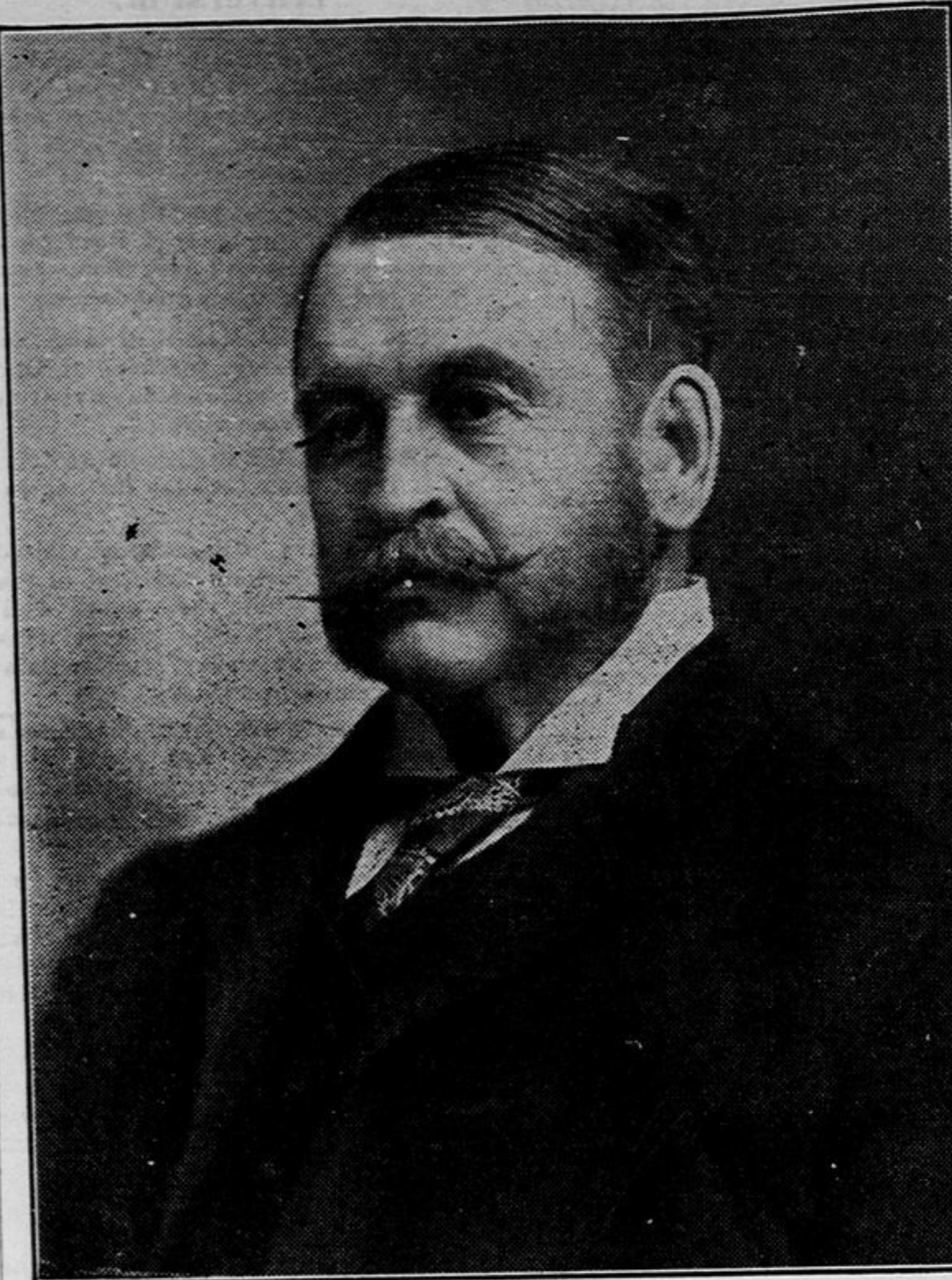
Hon. J. P. Whitney, Premier of Ontario.

Will be in Durham June 21 at Oddfellows' Demonstration.