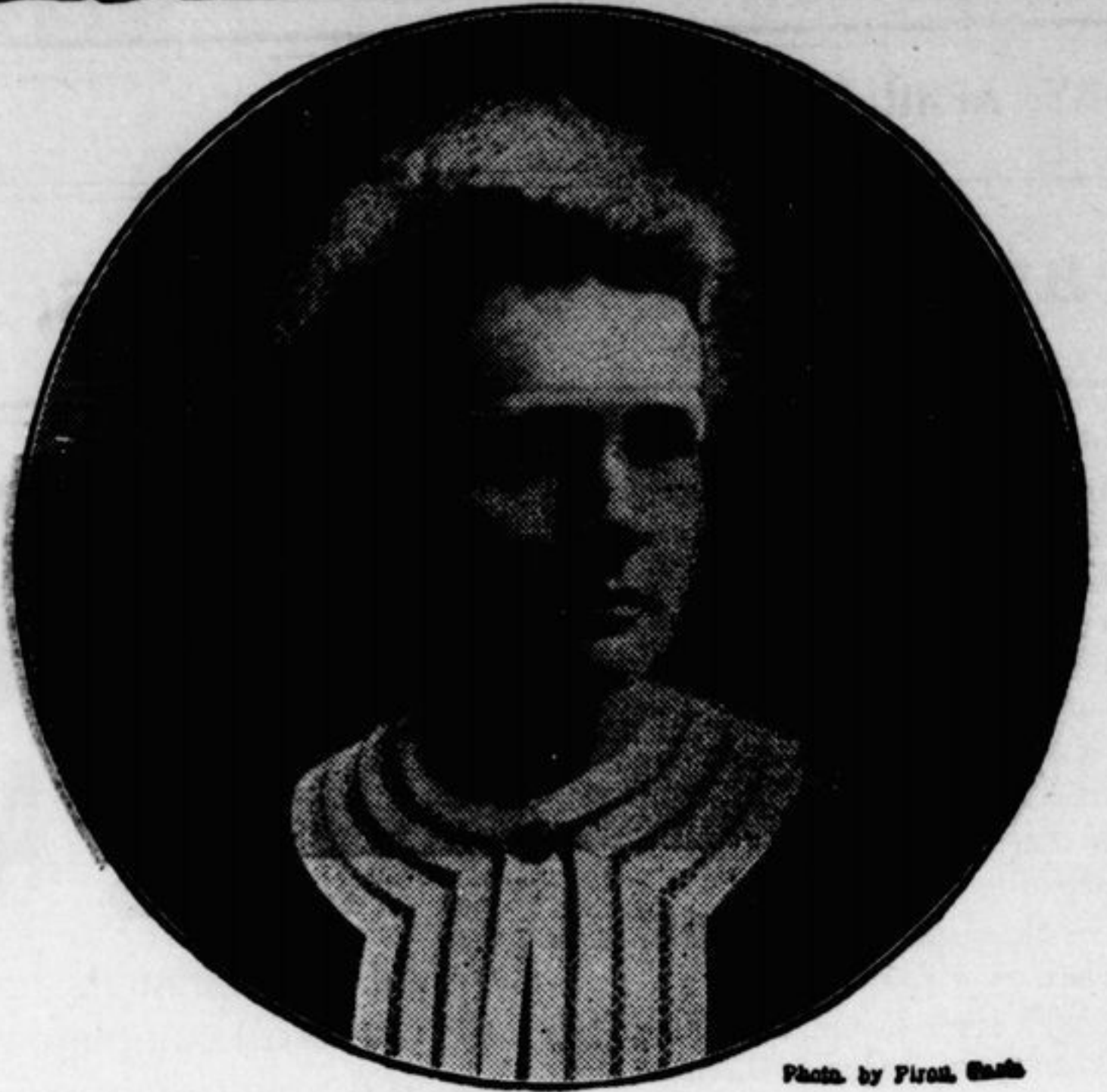
MADAME CURIE The Famous Discoverers of Radium

All the known radium in the world could be put into a tablespoon, yet this less than an ounce of the magic metal has set the scientists of two continents guessing at this new conundrum of nature.