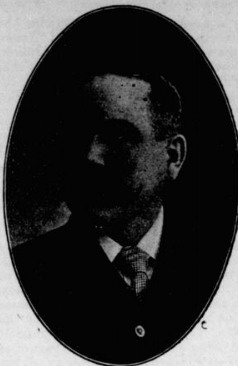
To The Electors of South Grey:

Watchmaker, Jeweller, Optician. DURHAM, ONT.